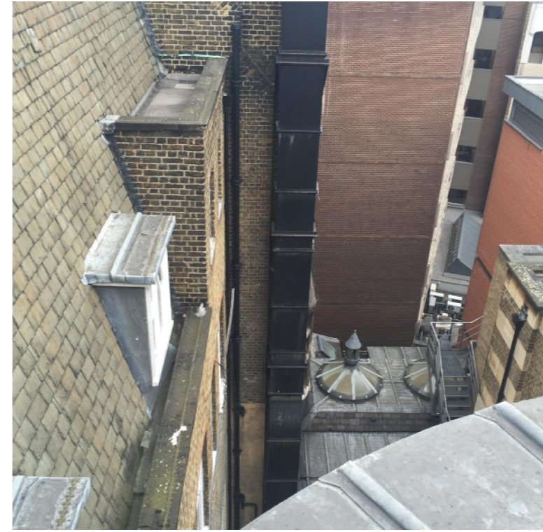
Pipe drop to between the curved bay and the mansard, down to basement level.