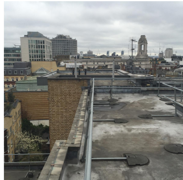
Fourth floor looking towards service core and south facing view. This is the proposed location for the fifth floor extension.