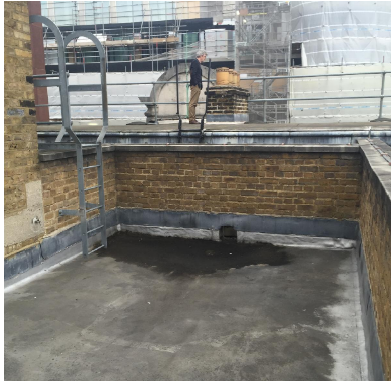
Plant Area No.2 in front of the existing lift overrun