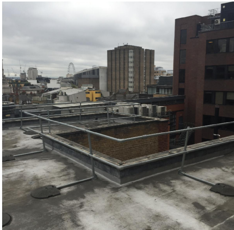
Fourth floor southwest facing view.