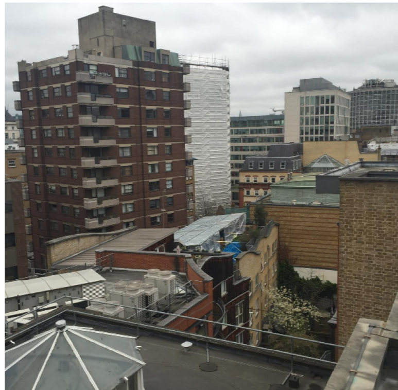
Fourth floor south east facing view.