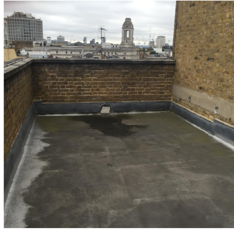
Plant Area No.2; for proposed external heat pump units