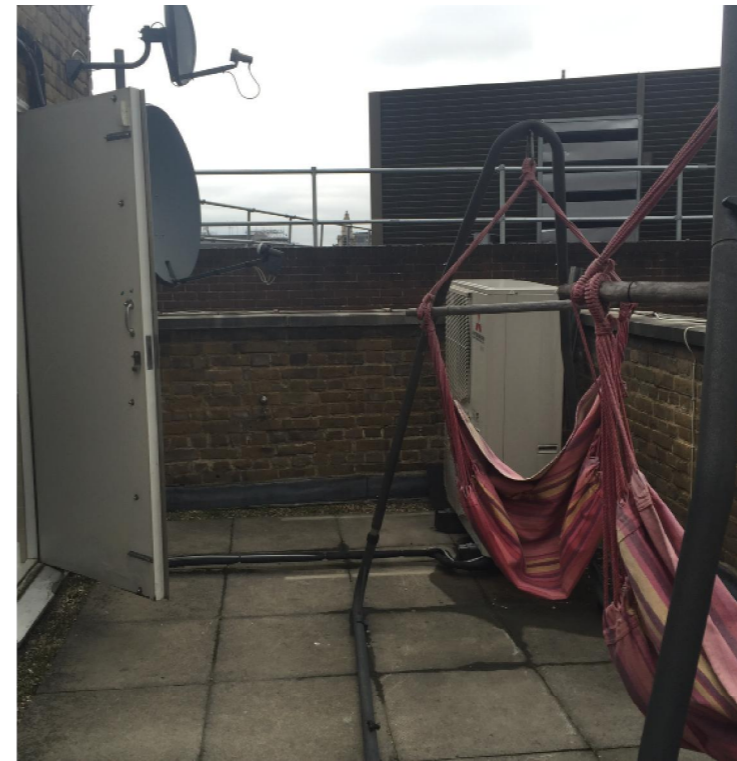
Fifth floor terrace; to serve as plant area for proposed heat pump units.