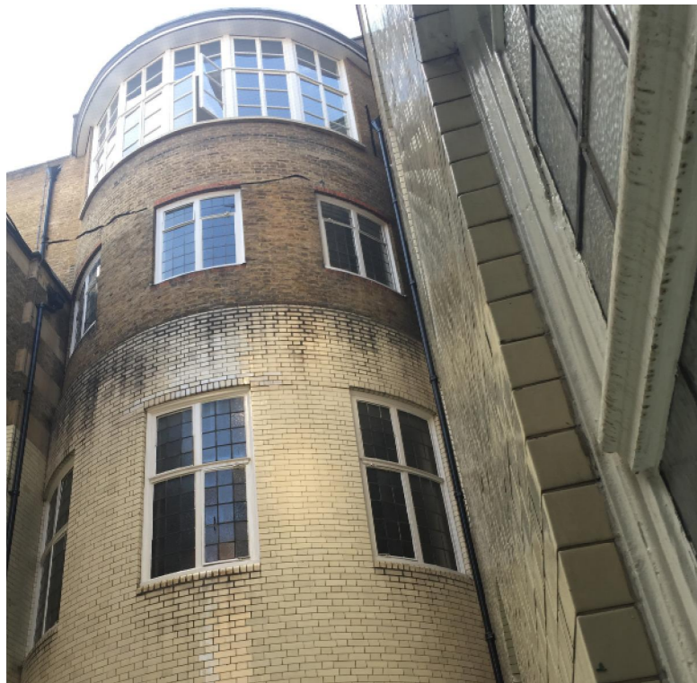
Pipe drop between the curved bay and the mansard, down to basement level. Note coordination with existing rain water pipework will be required.