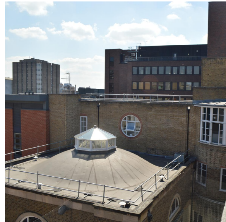
View from fifth floor terrace, plant area no.1.