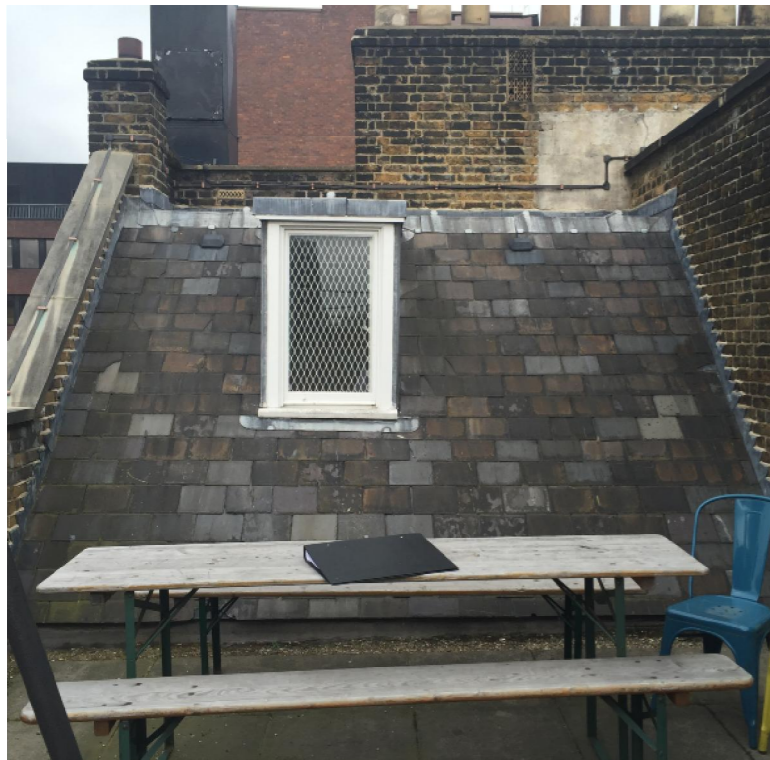
Fifth floor terrace to serve as plant area for outdoor heat pump units.