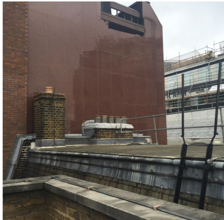
Rear of existing mansard roof