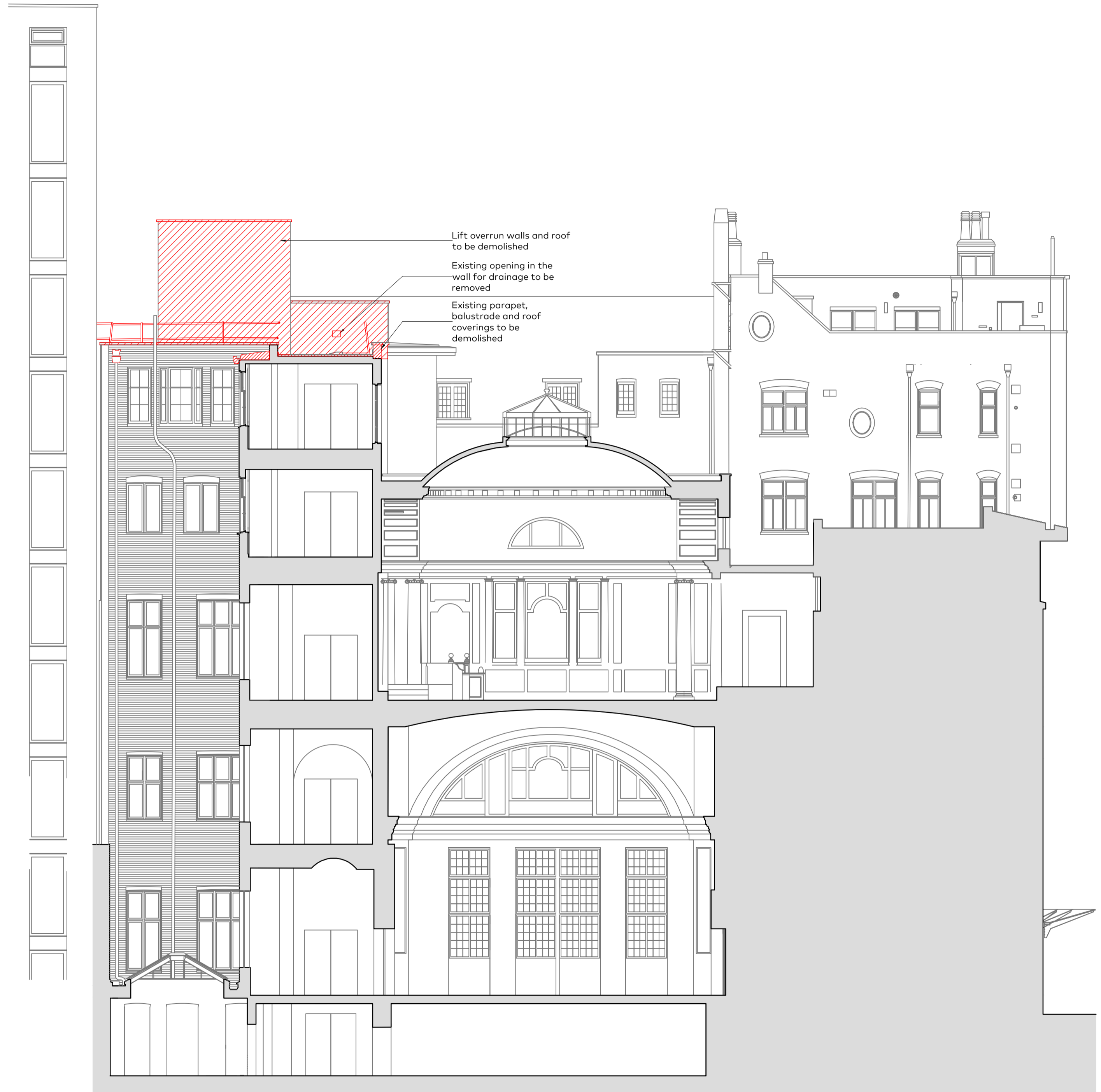
01 SOUTH EAST FACING ELEVATION As Existing with Demolitions