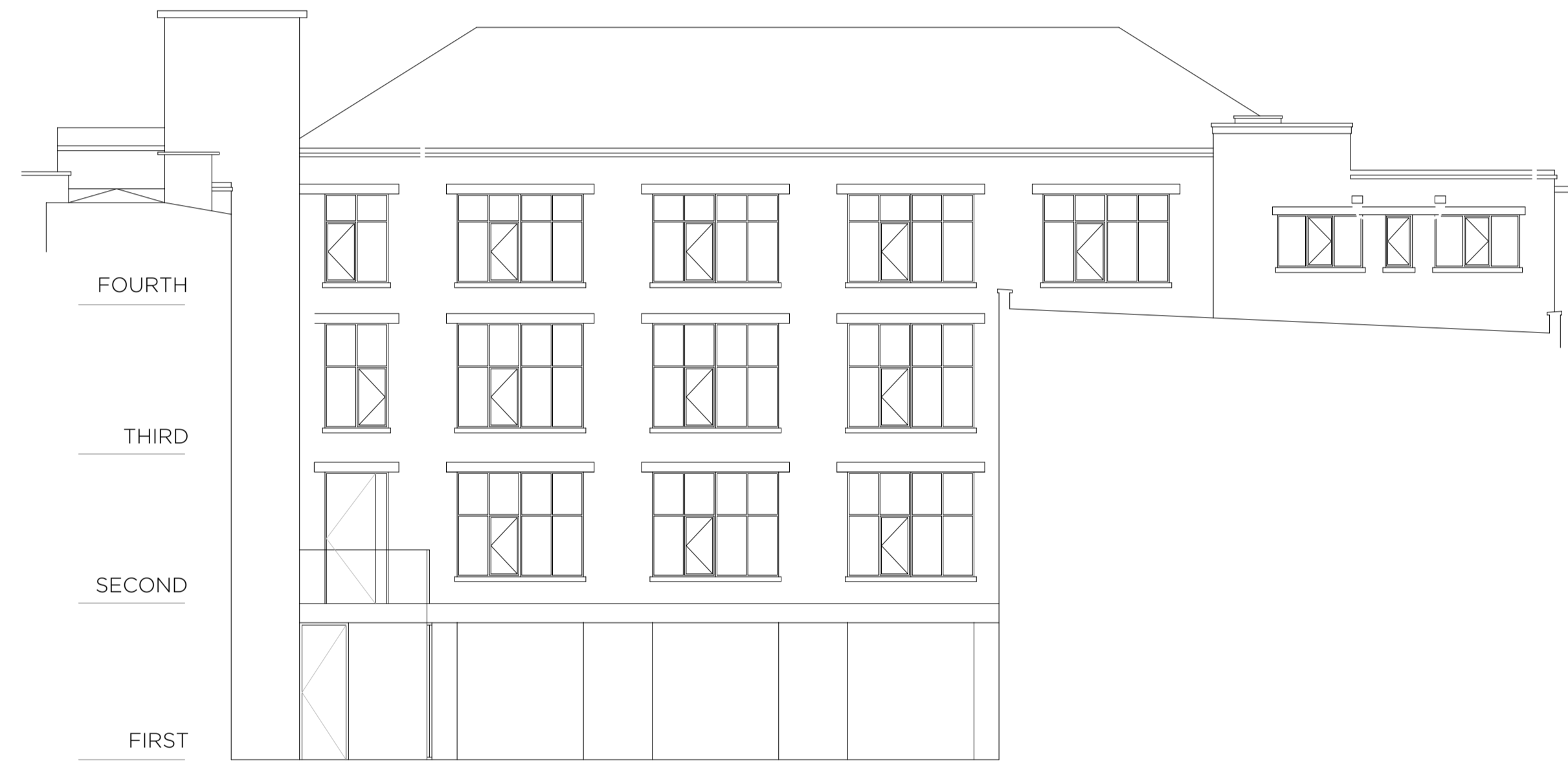
LIGHT WELL ELEVATION _ 2