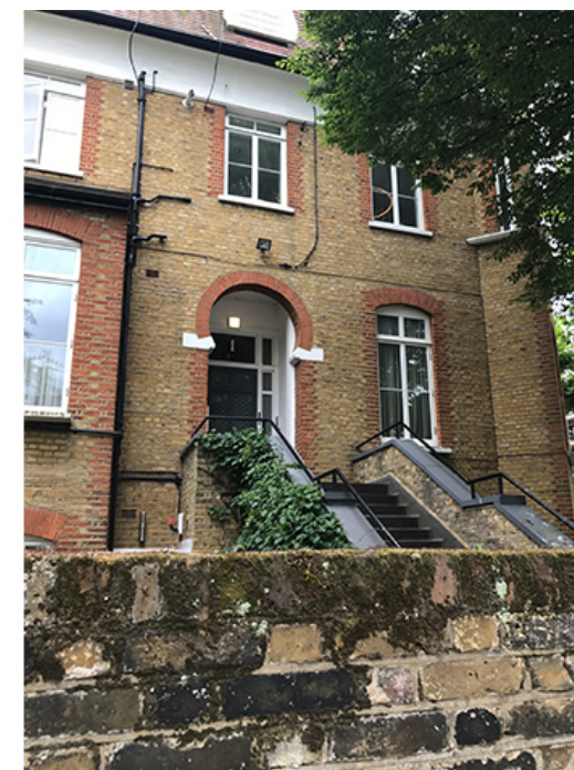
3 exterior views from Elsworthy Road