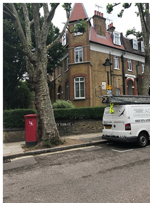
2 exterior view from Elsworthy Terrace