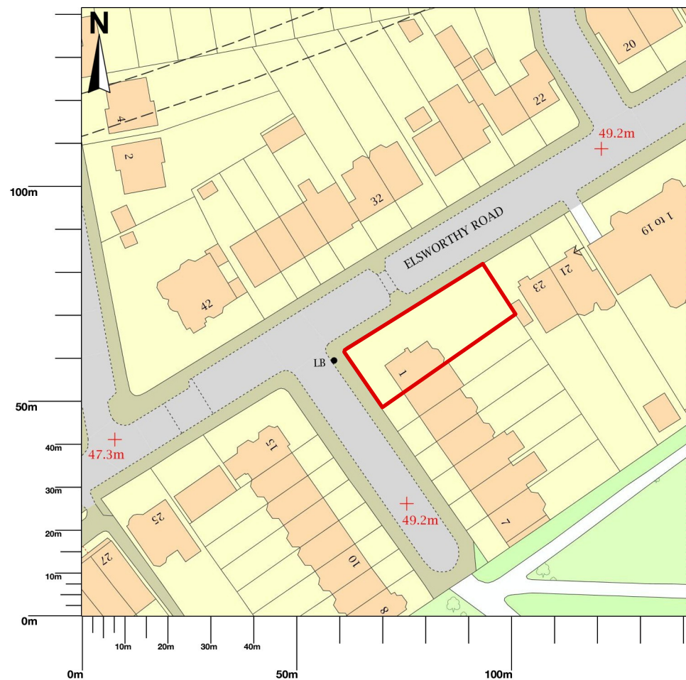
1 site location plan Scale: 1:1250