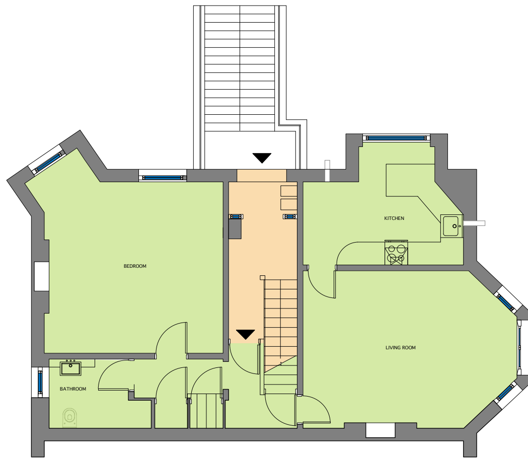
1 Existing ground floor flat Scale: 1:100