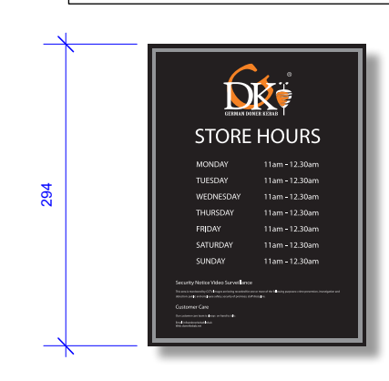
SIGN E - SIGNAGE CONTRACTOR TO SUPPLY & INSTALL NEW INTERNALLY APPLIED WINDOW VINYLS AS DWG 391-E:02

WAIN DONER REDAY 10 BE 30000 DEEP DESCALED STAINLESS STEEL SPRAYED WHITE WITH COOL WHITE LEDS TO ACHIEVE HALD II BY 10MM STAND OFF. 'GERMAN DONER KEBAB' SUB TEXT AND REGISTRATION MARK TO BE NON ILLUMINATEDFRET CUT SPRAYED WHITE ON 10MM STANDOFFS 'SPIT' LOGO TO HAVE ORANGE TRANSLUCENT VINYL APPLIED TO FACE