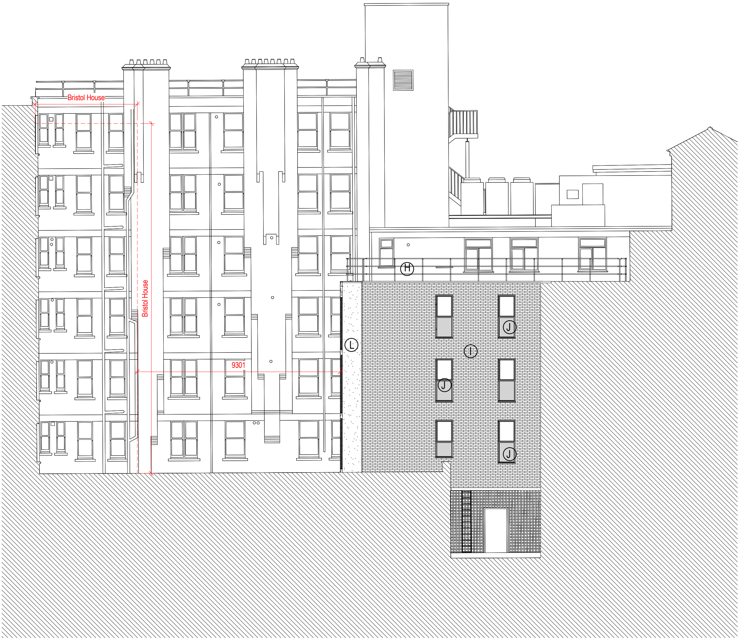
Elevation/Section B - As Proposed 1 : 100