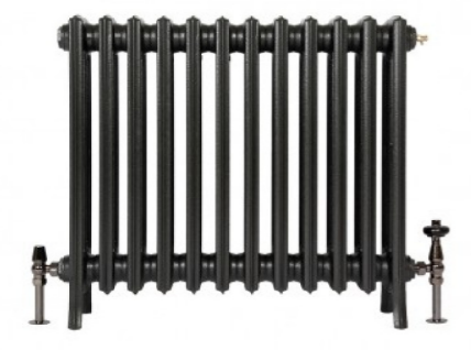
Radiator Specification Manufacturer: Cast Rads Grace Column - Length & height to suit room