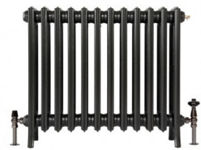
Radiator Specification Manufacturer: Cast Rads Grace Column - Length & height to suit room