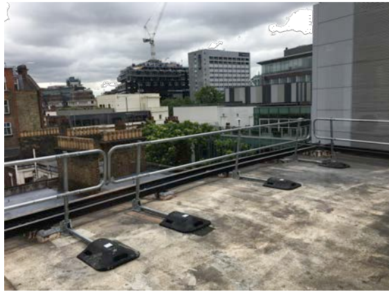
Photo showing the existing collapsible balustrade to the roof area