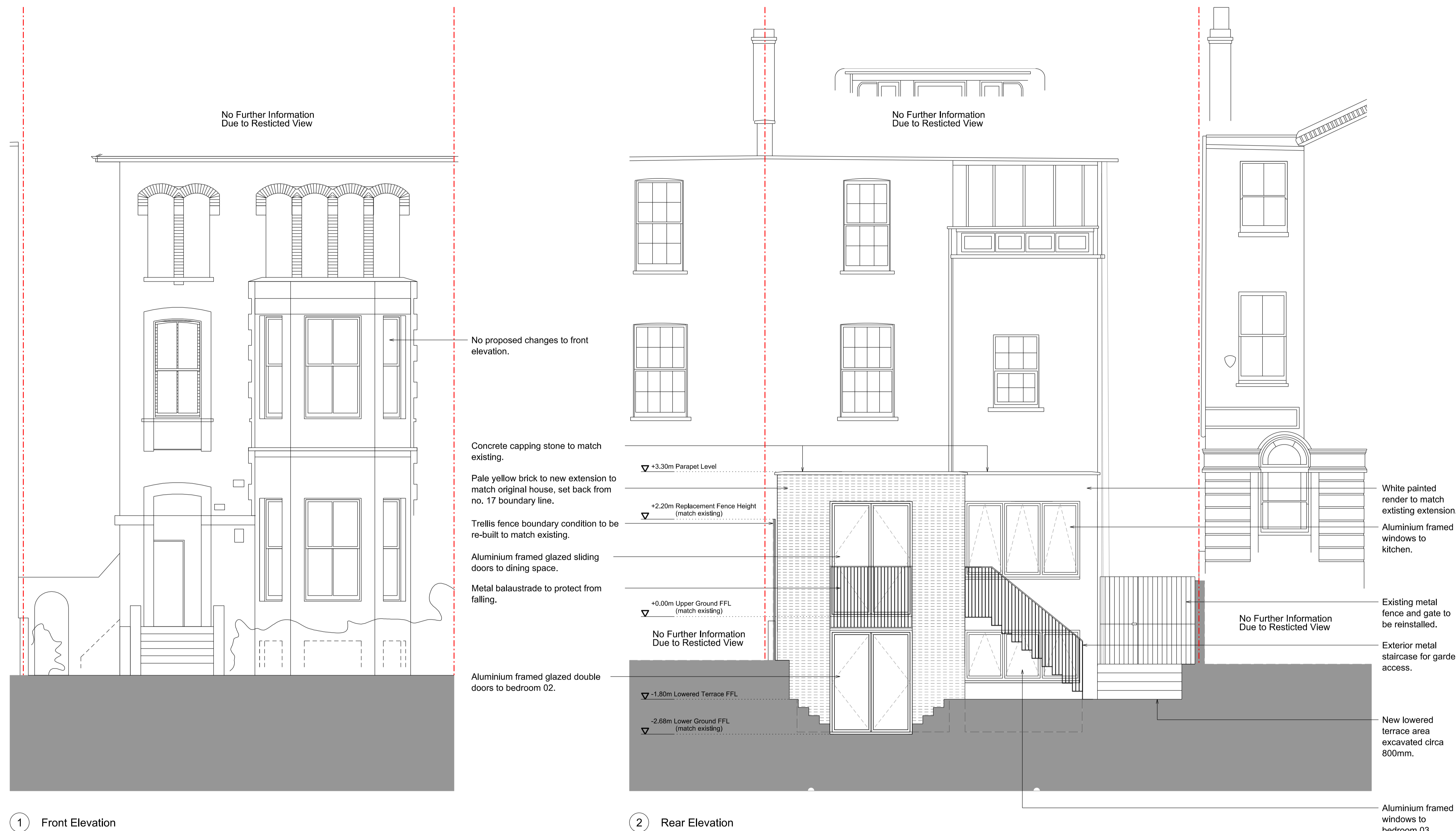
1 Front Elevation