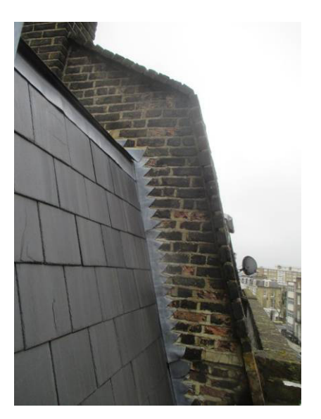
mansard roof front