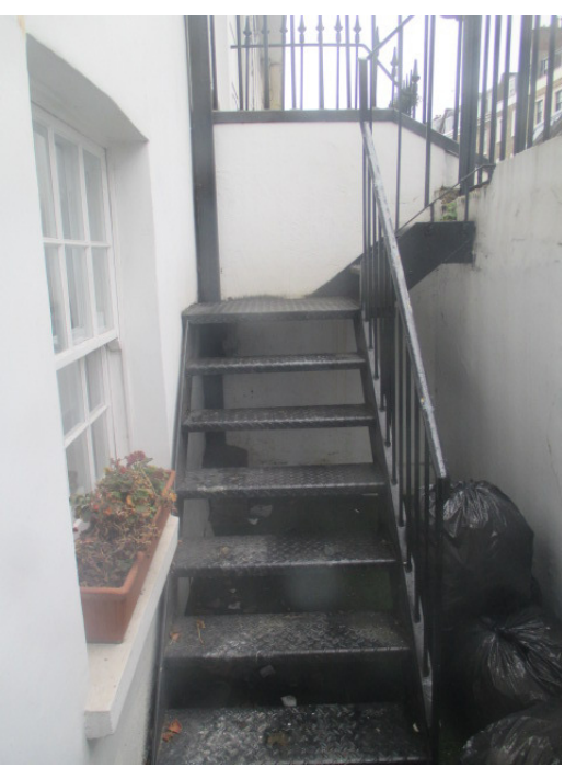
Front area steps