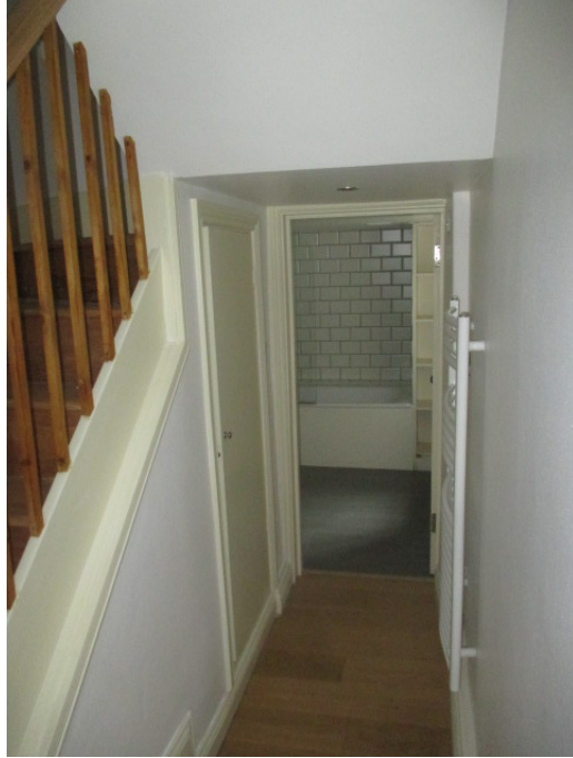
Hall towards bathroom