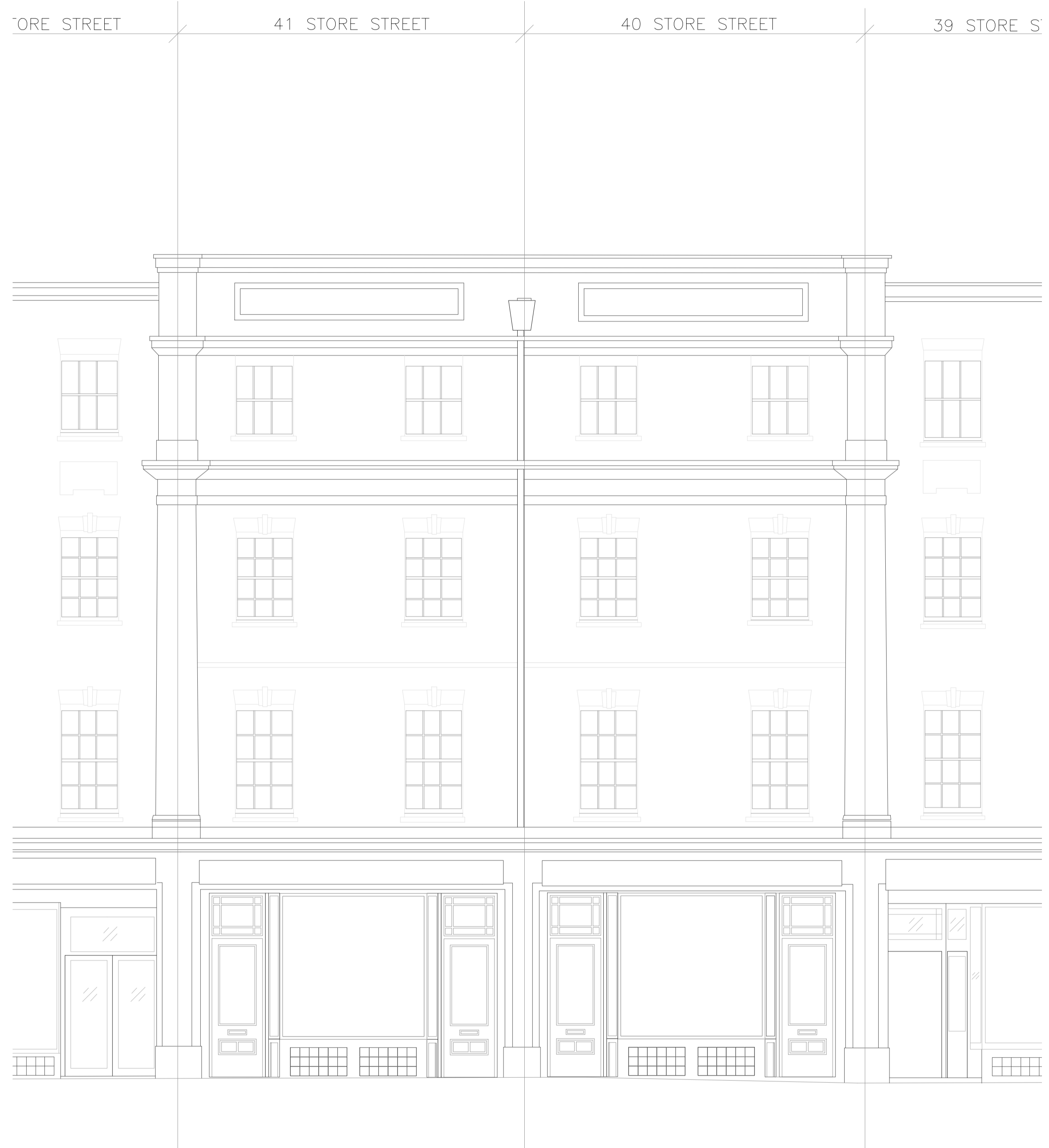
FRONT ELEVATION As Existing