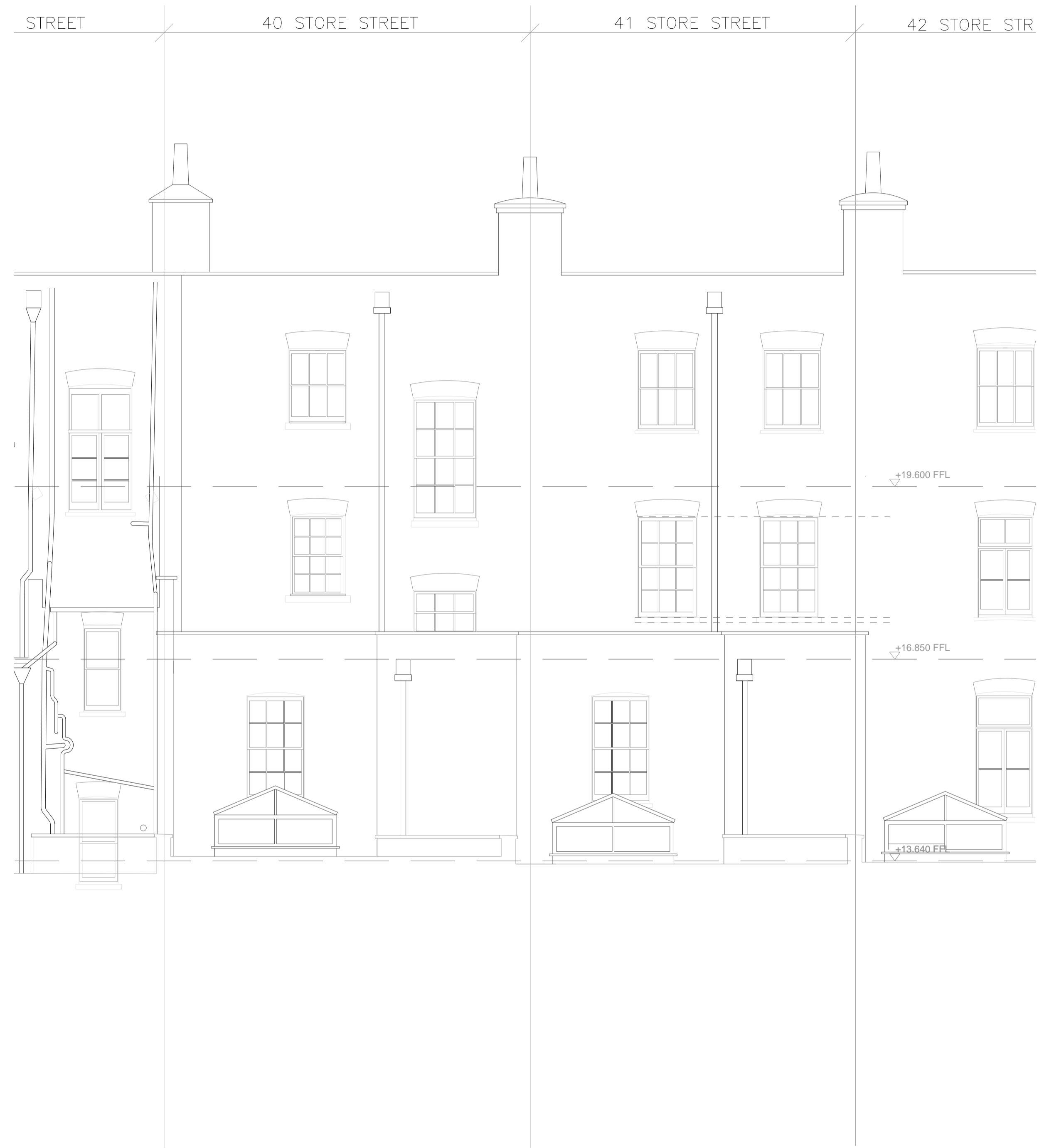
REAR ELEVATION As Existing