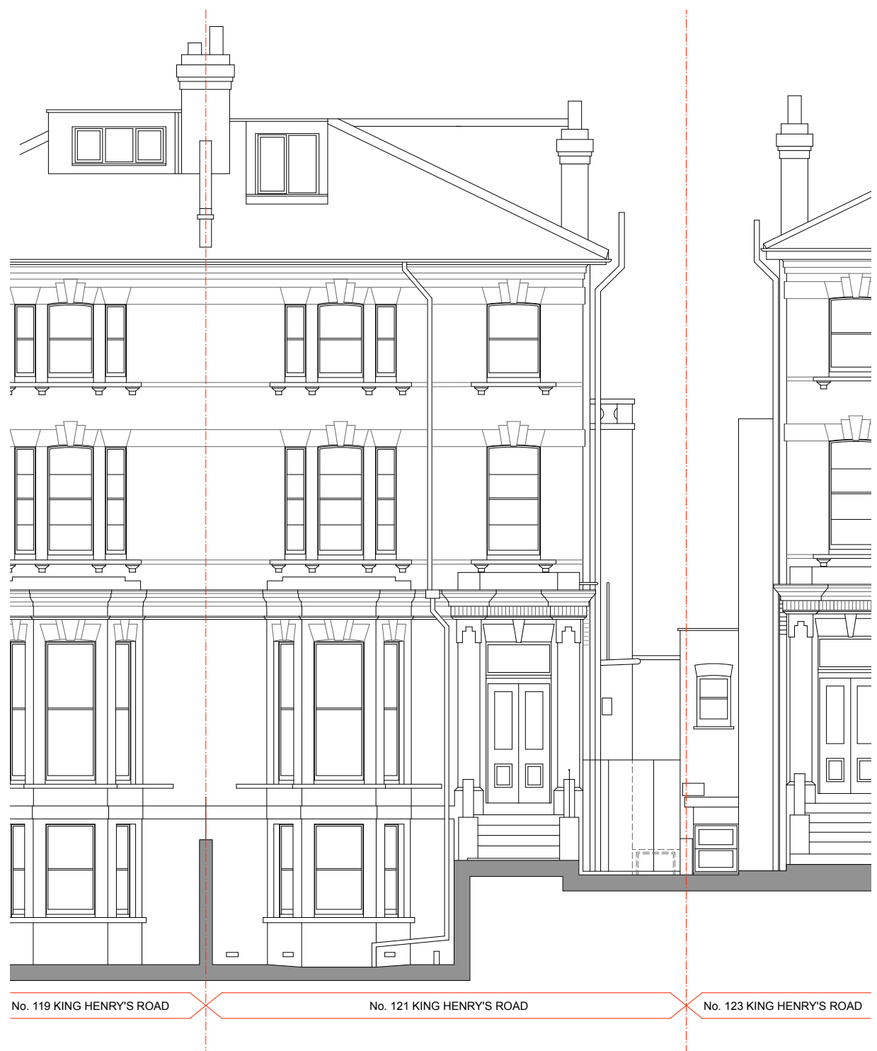
1 EXISTING FRONT ELEVATION 1:100 @ A3