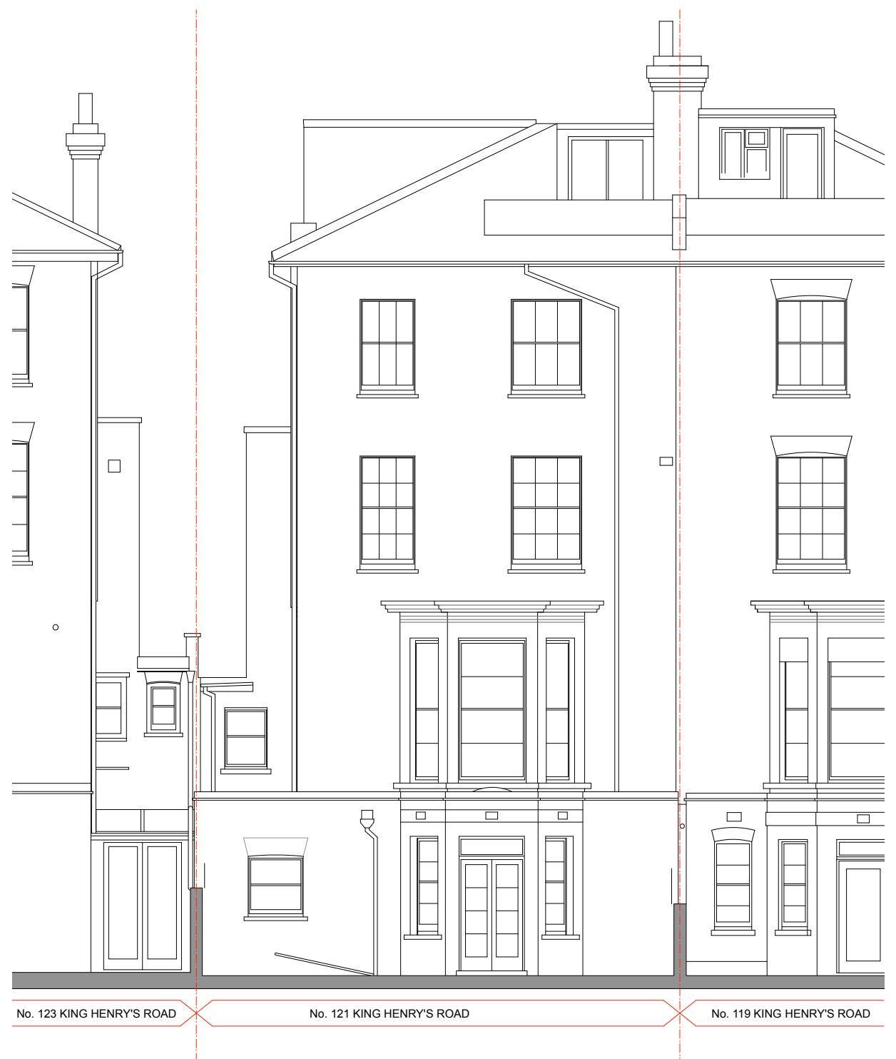
2 EXISTING REAR ELEVATION 1:100 @ A3

P2 27.07.18 Issued for Planning P1 22.05.18 Issued for Planning PH1 20.03.18 Issued for Pre-Planning REV 1 date: note do not scale drawing copyright © architects ltd