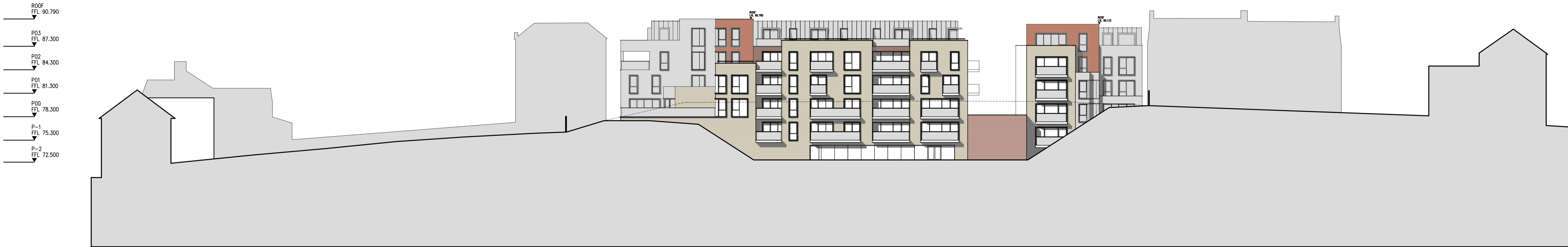
2 GONDAR GARDENS REAR ELEVATION 3-3 SCALE: 1:250 (A1)