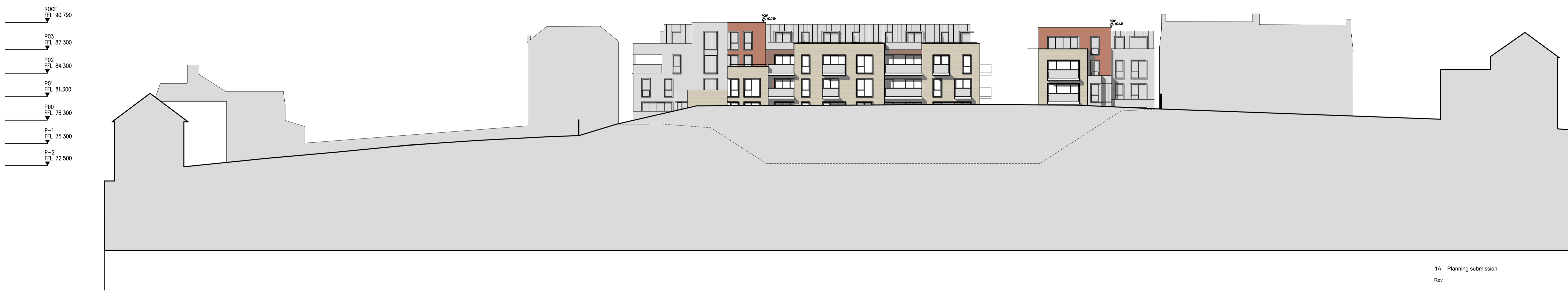
2 GONDAR GARDENS REAR ELEVATION 2-2 SCALE: 1:250 (A1)