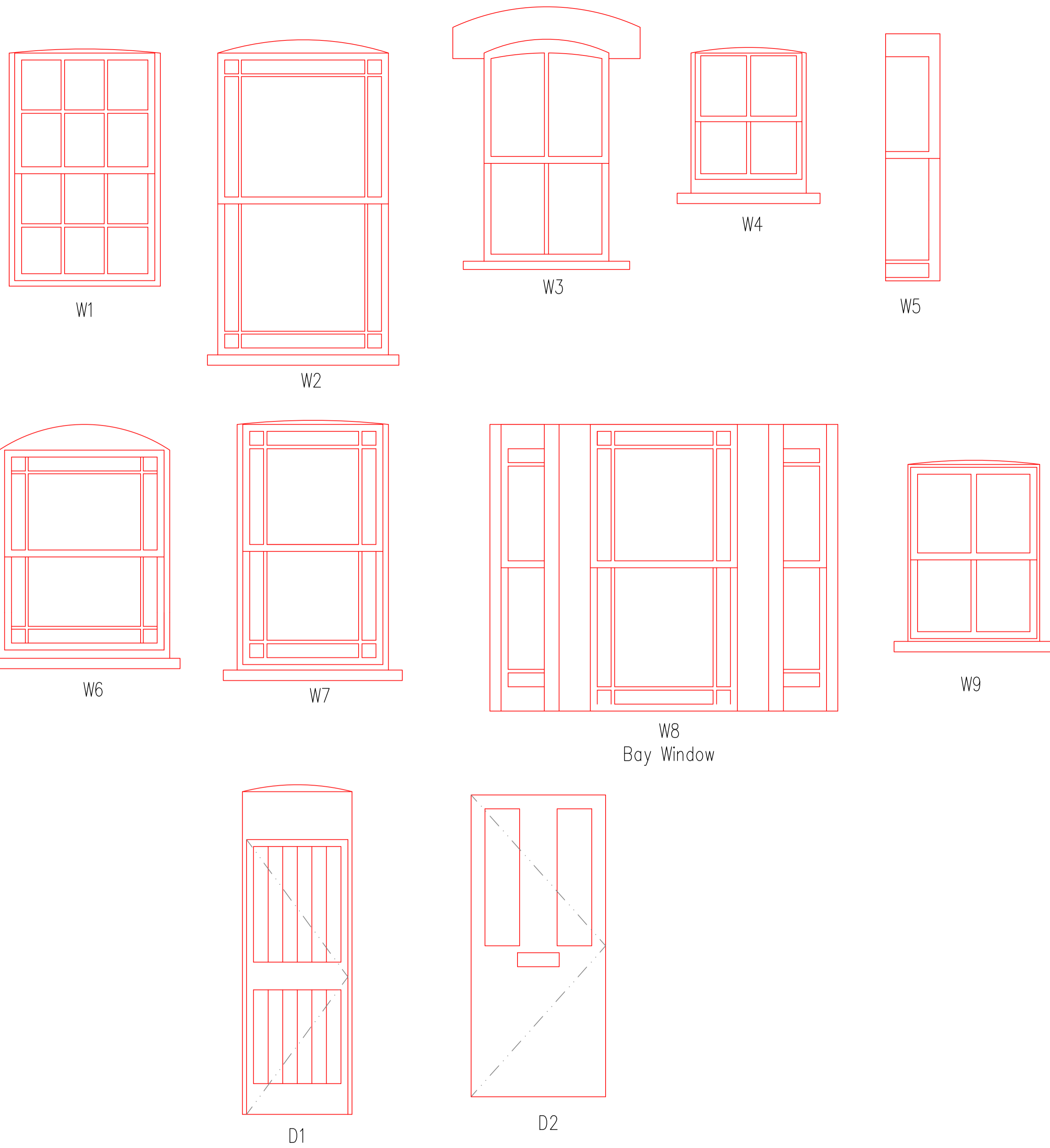
Proposed Windows And Doors 1:20