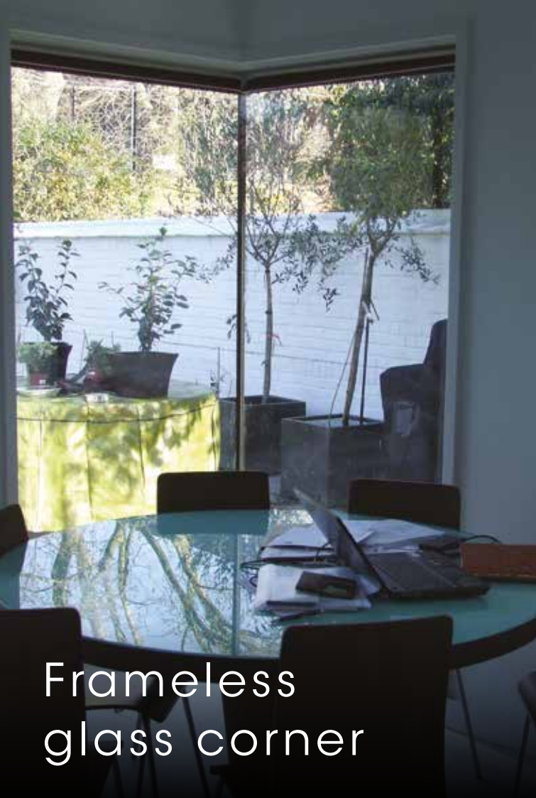
Frameless glass corner