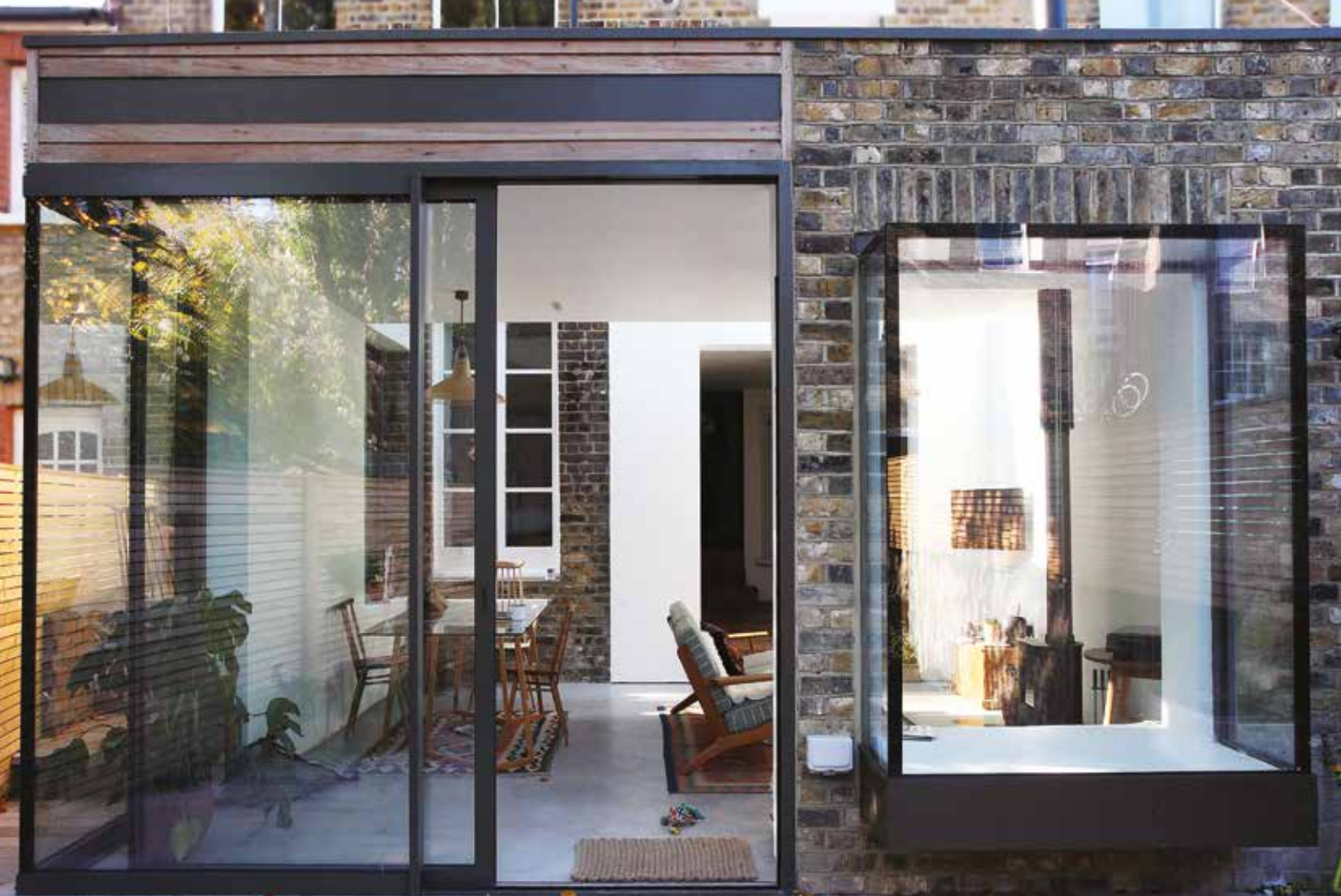
Frameless glass box with super slim sliding doors available from Aliplast and Sunflex.