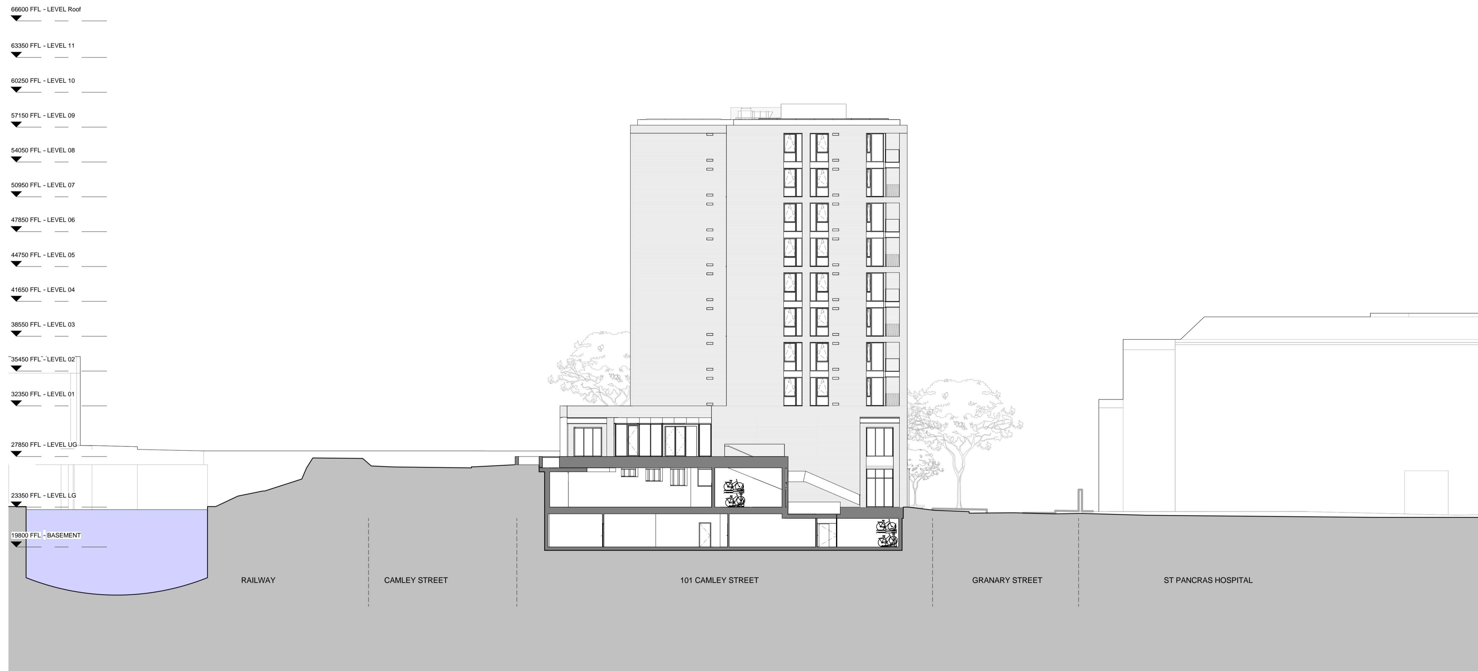
Proposed North West Elevation (South Block)