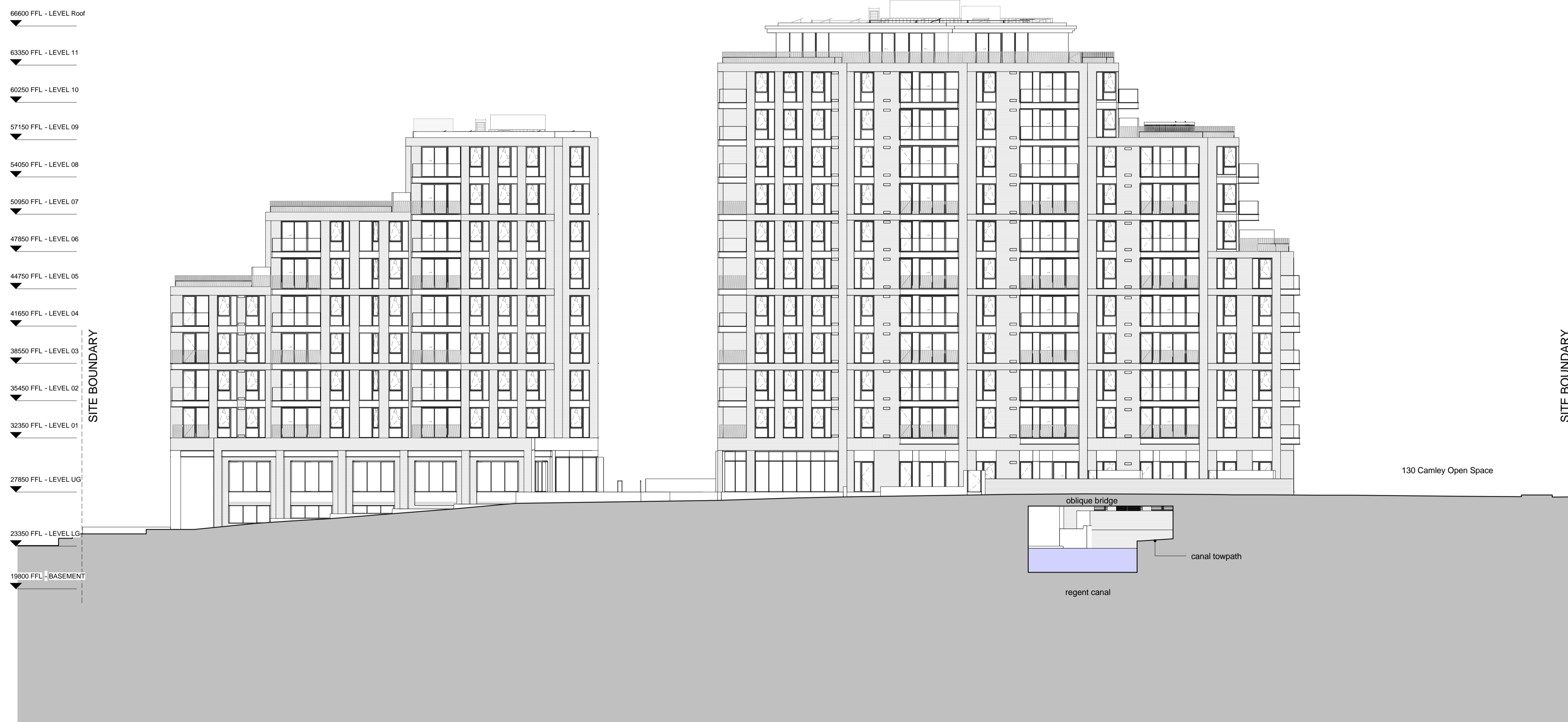
Proposed North East Elevation - Camley Street