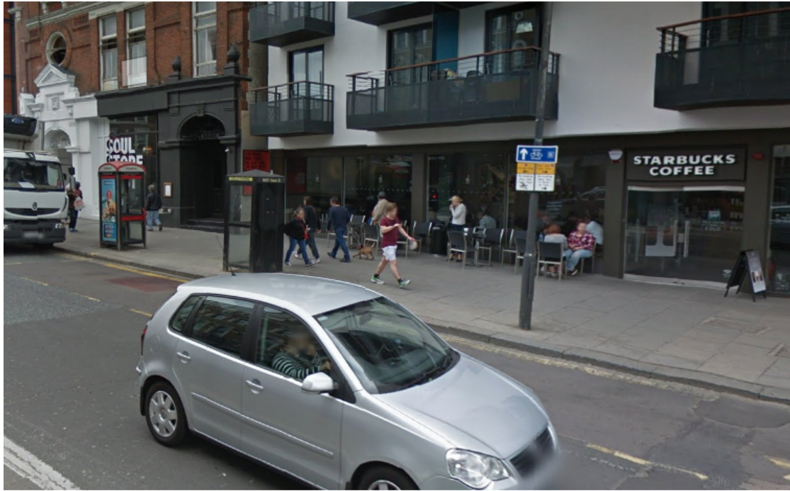
Kiosk outside 24 Kilburn High Road (Removal to be secured by Section 278 legal agreement)