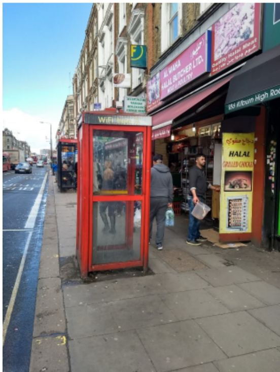
Photo 4: Kiosk outside 188 Kilburn High Road (Removal to be secured by Section 278 legal agreement)