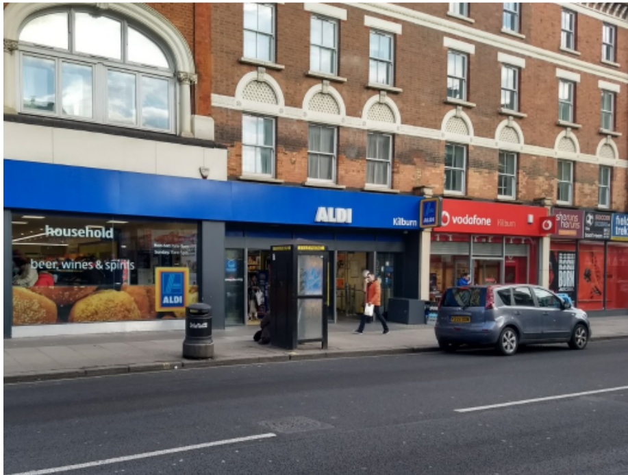
Photo 1: Existing kiosk outside 158 Kilburn High Road (to be replaced with new kiosk)