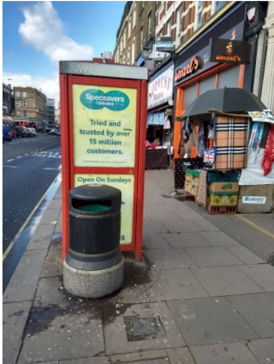
Photo 3: Kiosk outside 106 Kilburn High Road (Removal to be secured by Section 278 legal agreement)