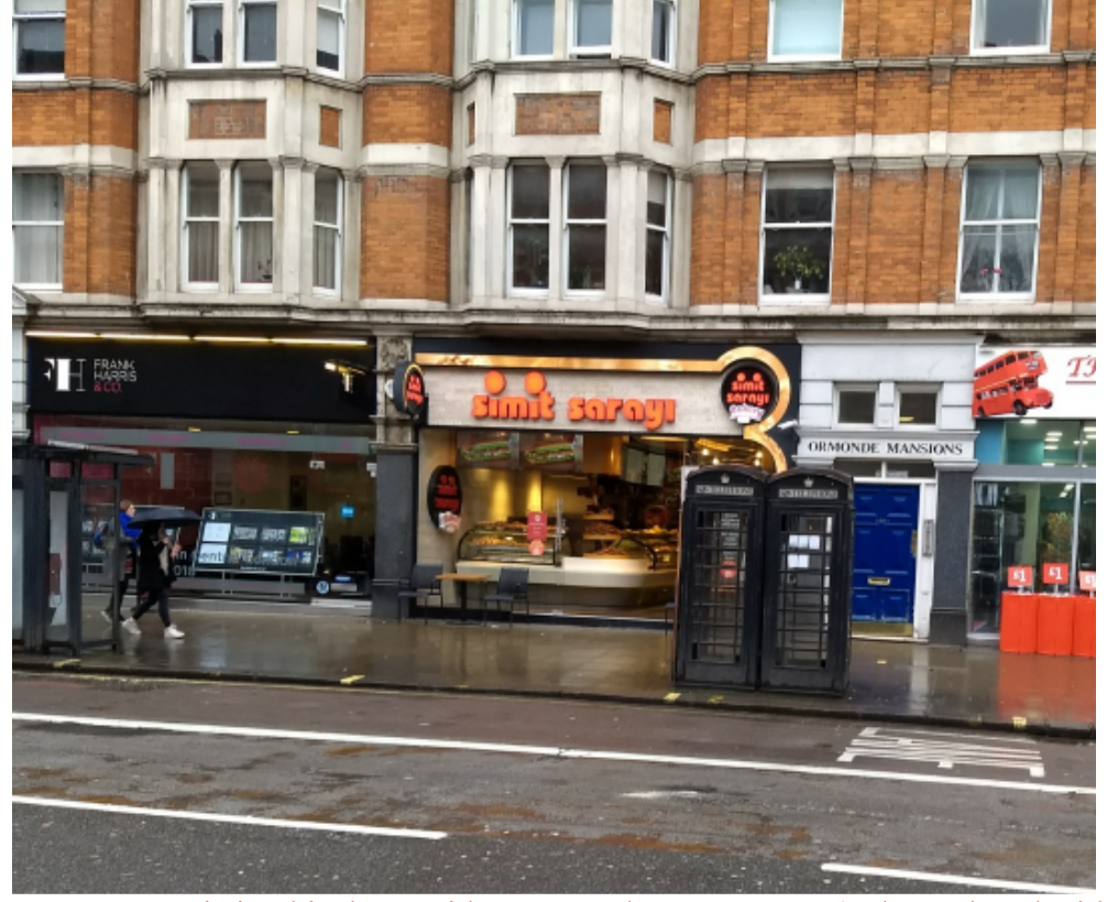
Photo 1: Two existing kiosks outside 100 Southampton Row (to be replaced with 1 new kiosks)