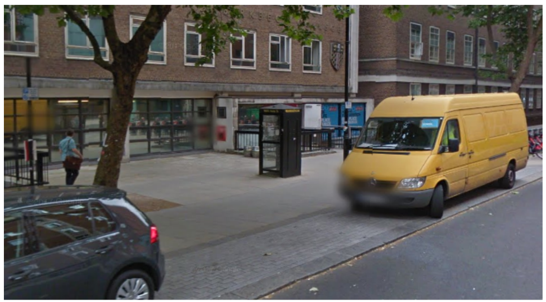
Photo 3: Existing kiosk at Malet Street (Removal without replacement to be secured under a Section 278 Agreement).