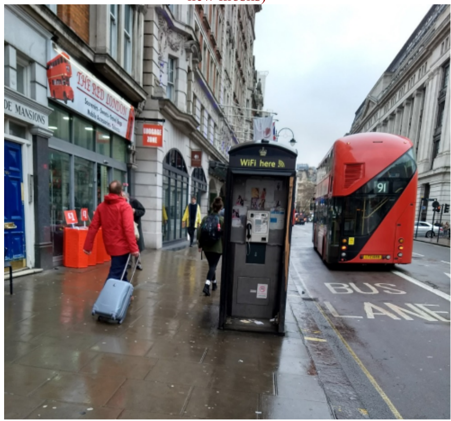
Photo 2: North elevation of existing kiosks at 100 Southampton Row