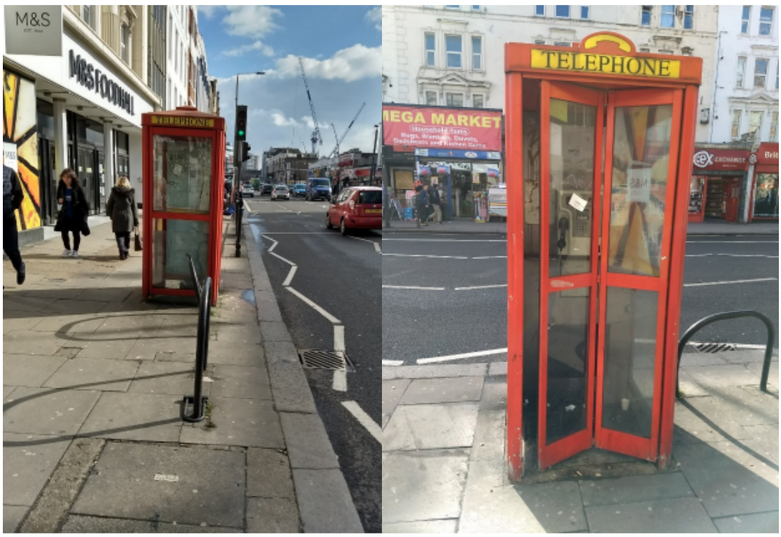
Photos 1 and 2: Existing kiosk outside 72 Kilburn High Road (to be replaced)