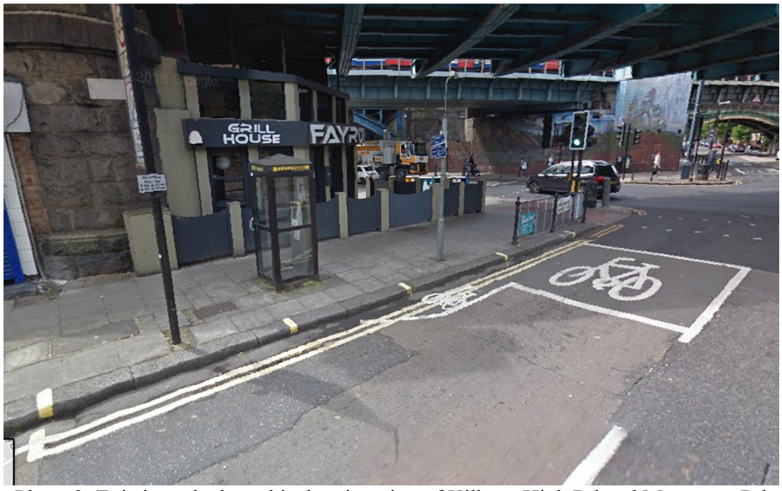
Photo 3: Existing telephone kiosk at junction of Kilburn High Rd and Maygrove Rd (Removal to be secured by a Section 278 agreement)