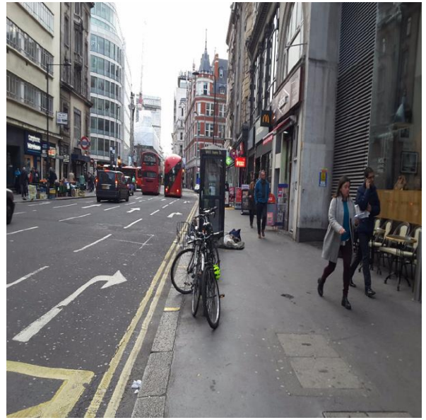
Photo 1, 2 and 3 show the location of the existing kiosk and its surrounding area.