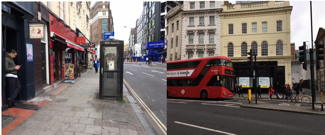
Photo 4 shows the Grade II Listed Building opposite the site.