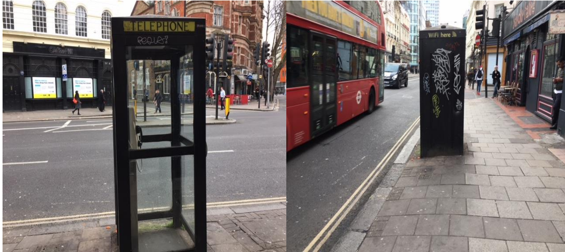
Photos 1, 2 and 3 below show the existing kiosk and its surroundings