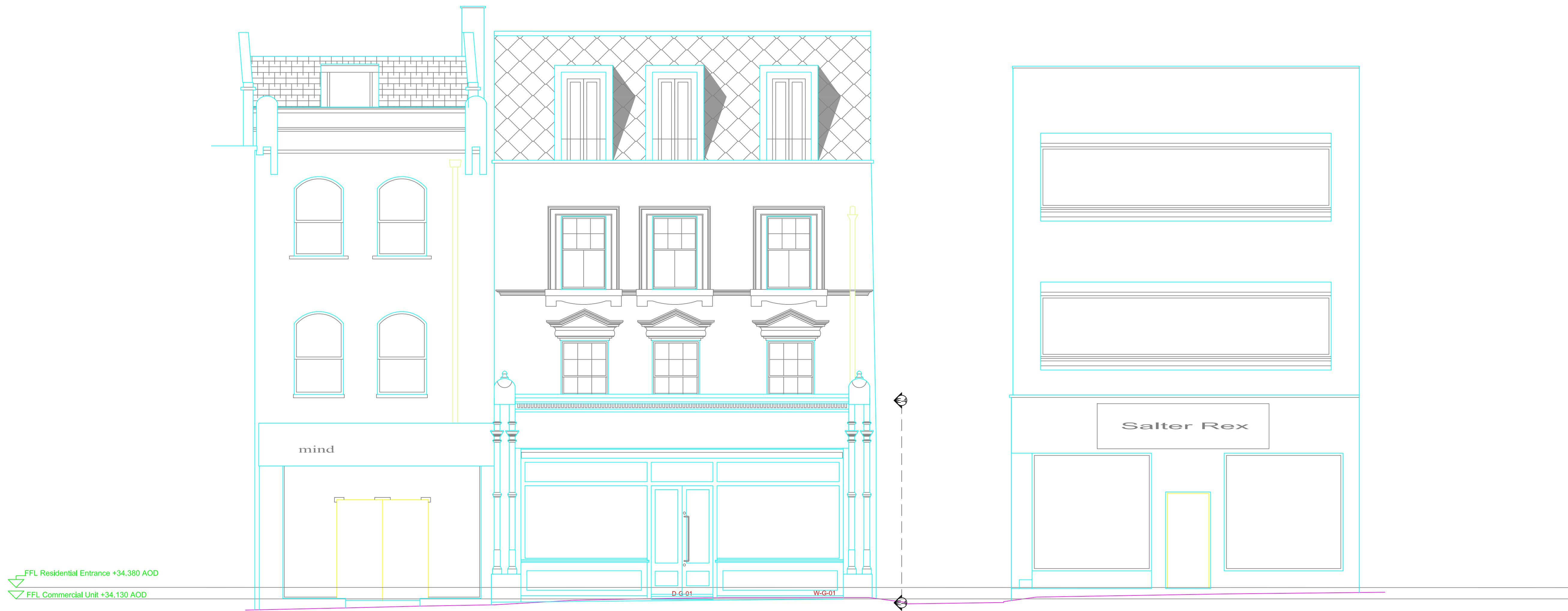
Elevation 3 - Shop Front Scale 1:50 @ A1