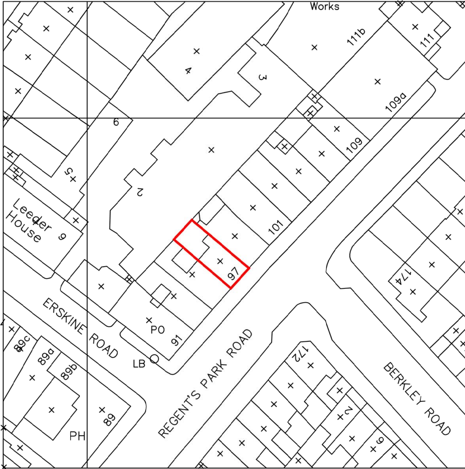
SITE PLAN scale 1:500