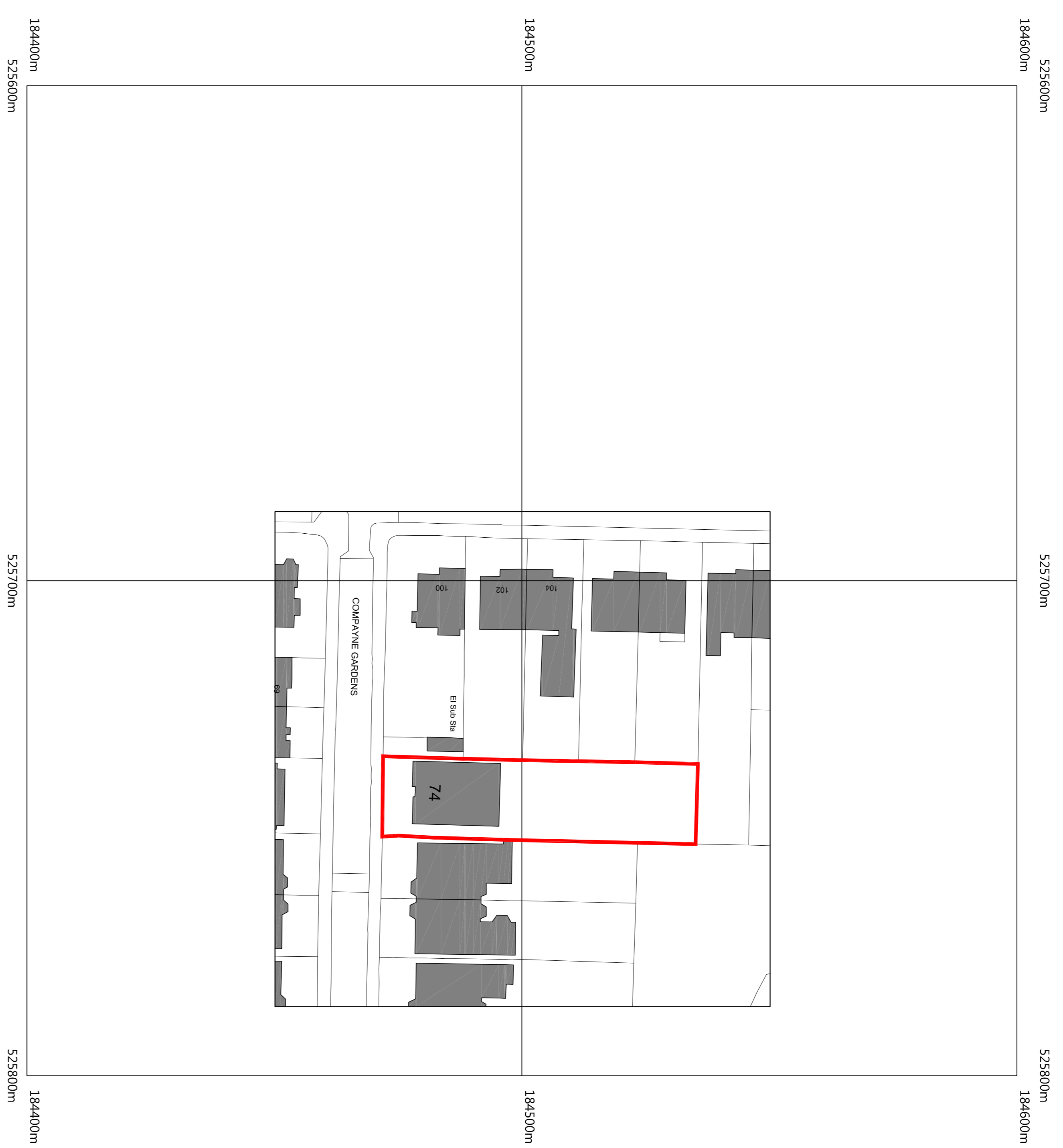
Location Plan SCALE 1:1250@A3 LP-01