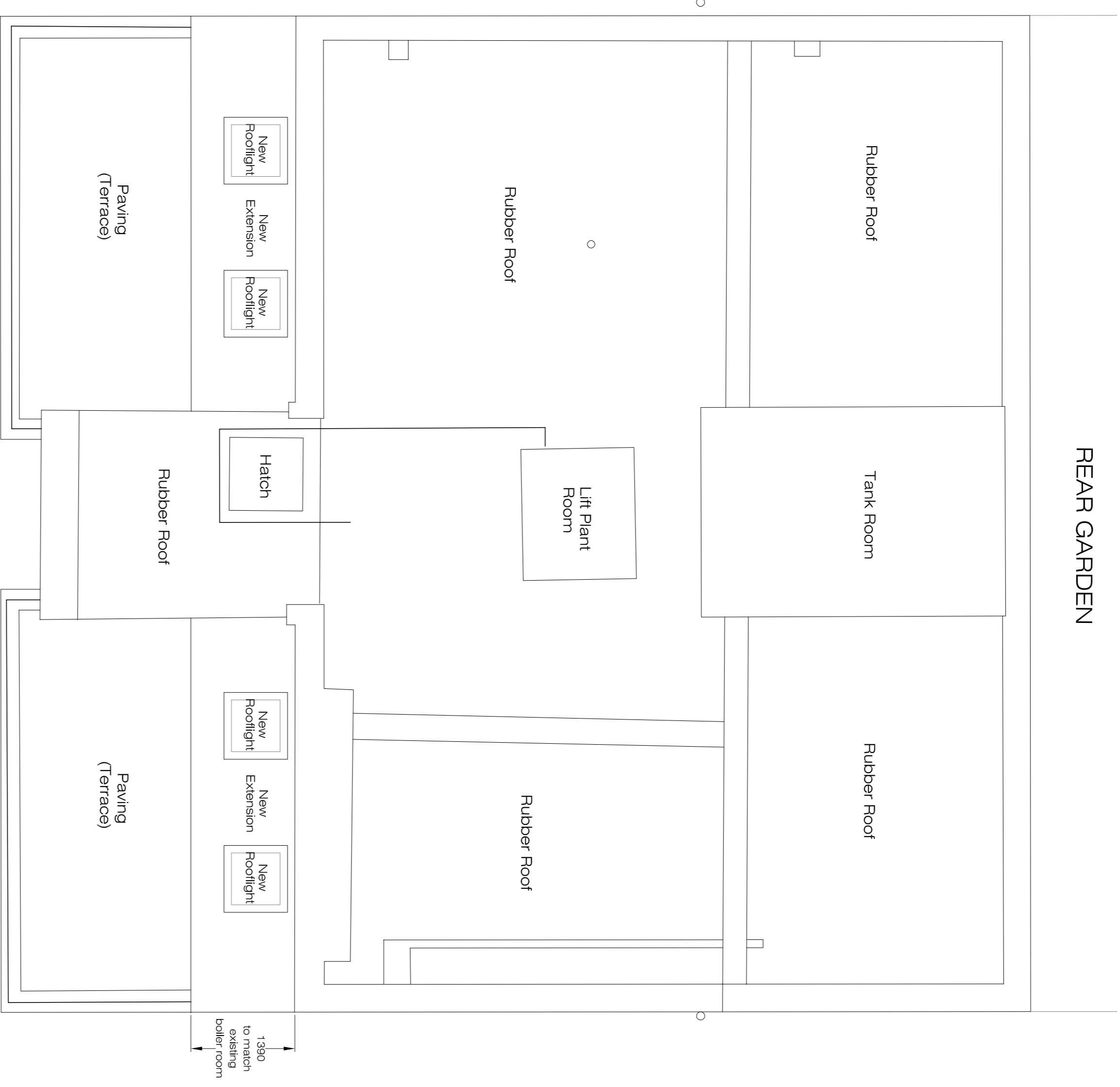
PROPOSED Roof Plan SCALE 1:100@A3 PA-01