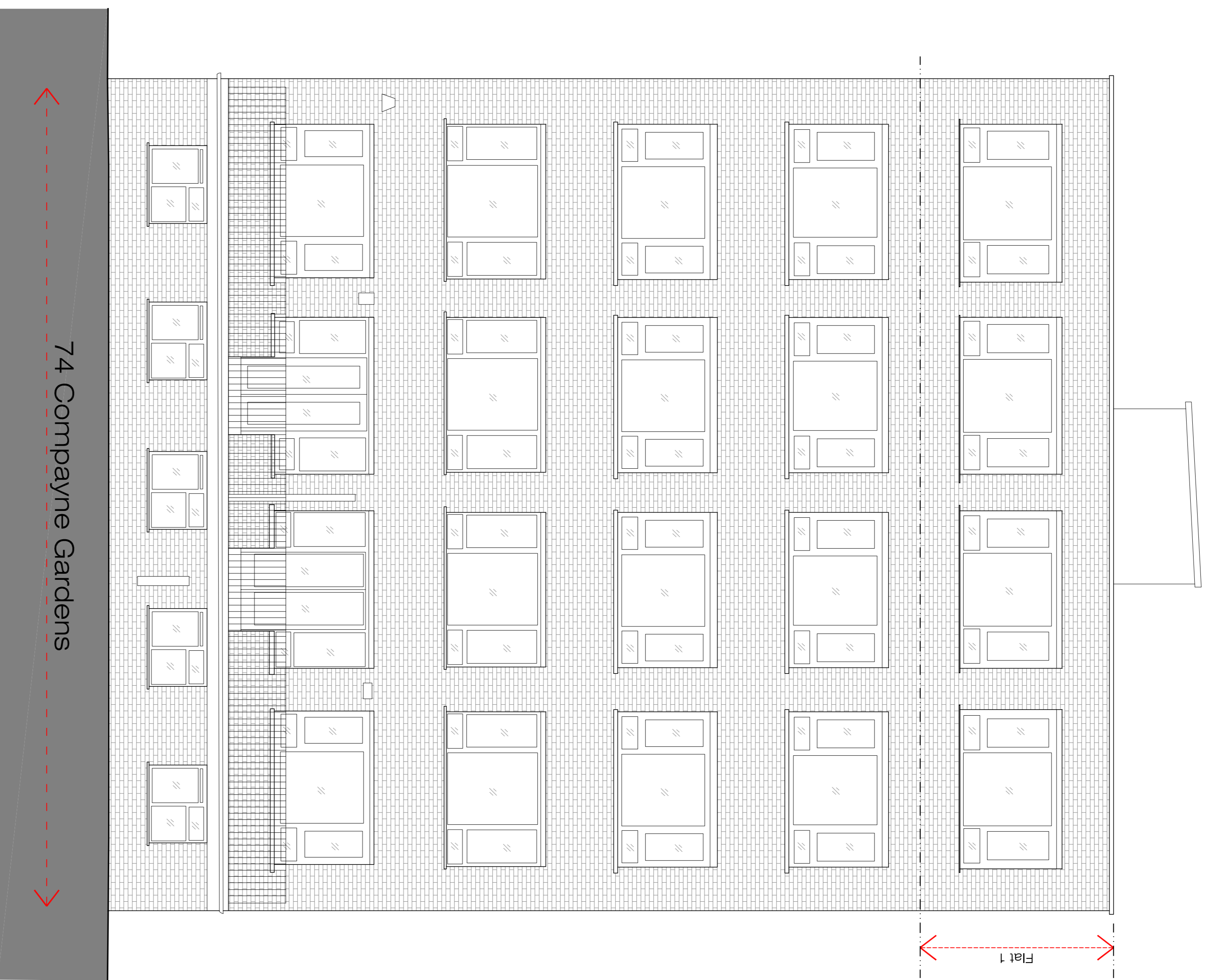
PROPOSED Back Elevation (Flat 1) - NO CHANGES SCALE 1:100@A3 PA-04