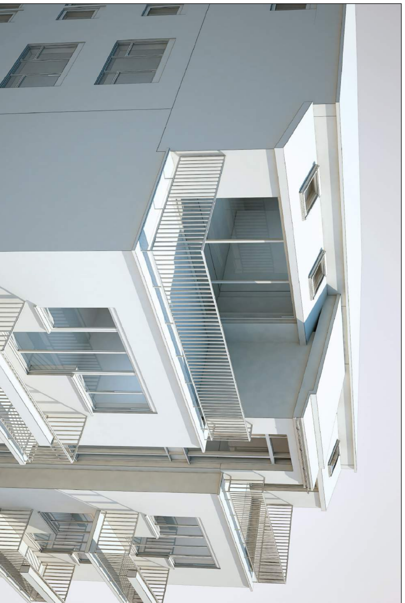
Proposed View 1