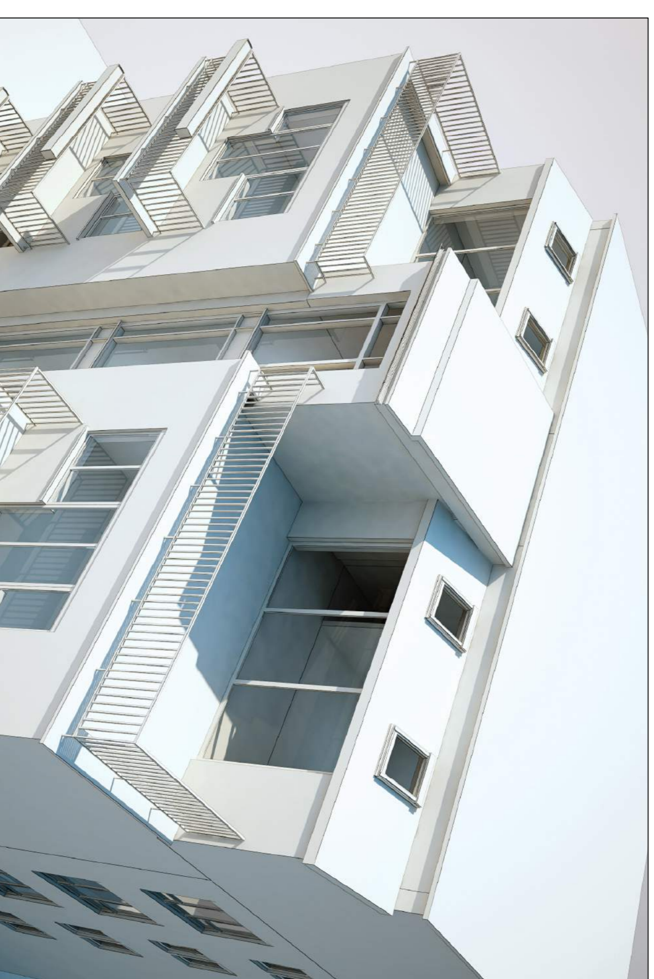
Proposed View 2