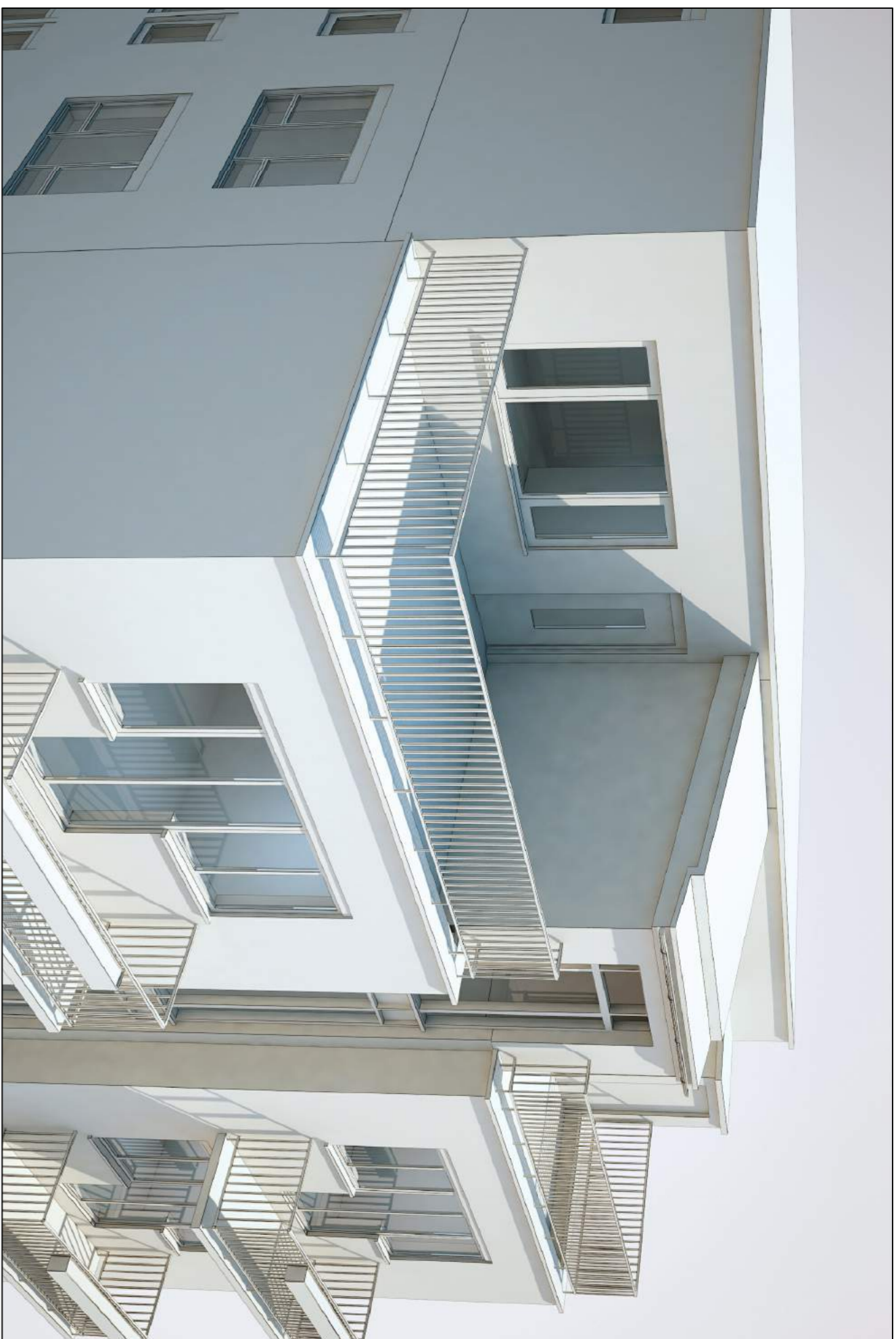
Existing View 1