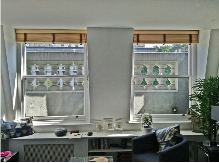
views out from front living area