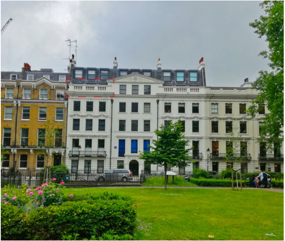
View from Bloomsbury Square