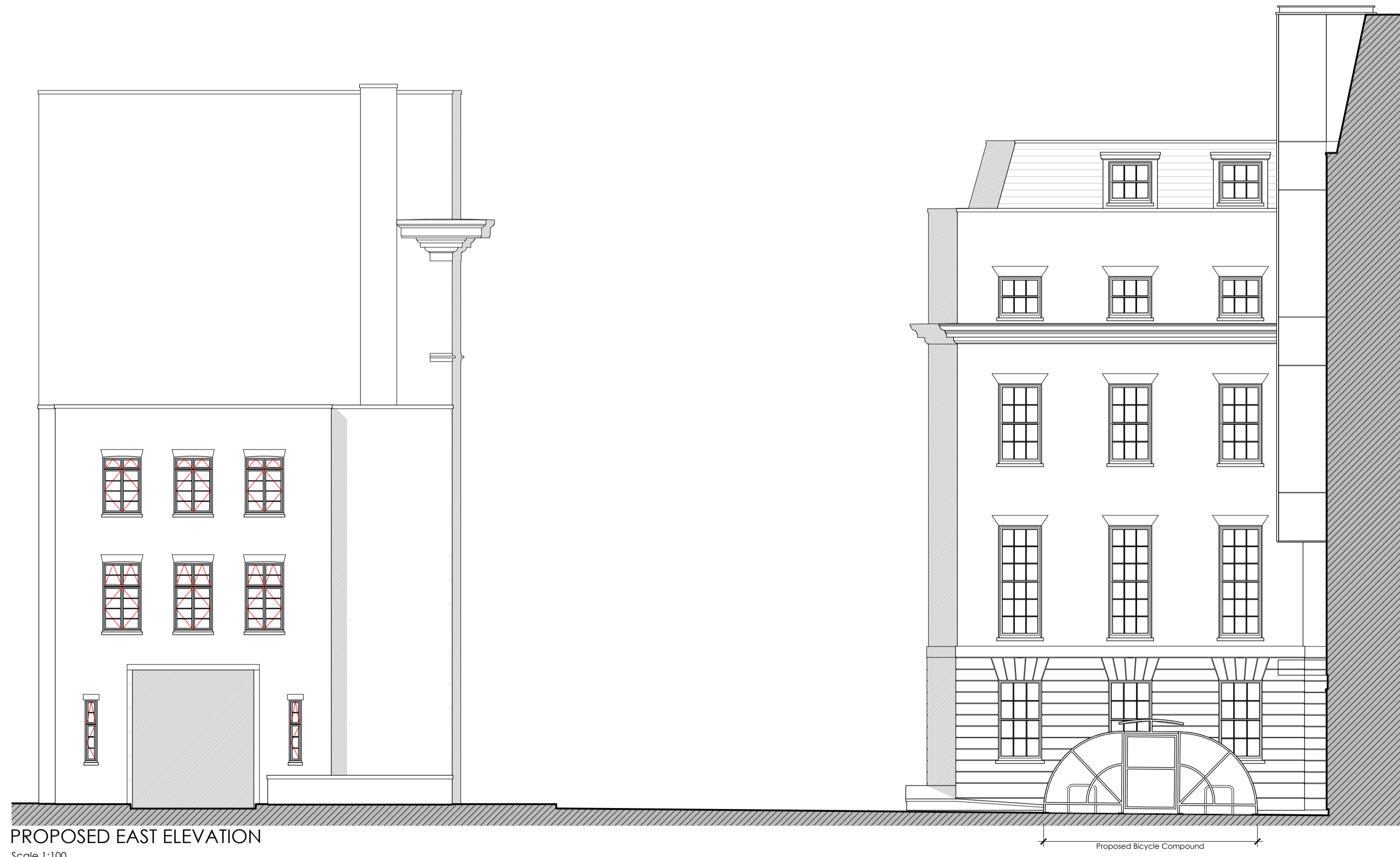
PROPOSED EAST ELEVATION Scale 1:100