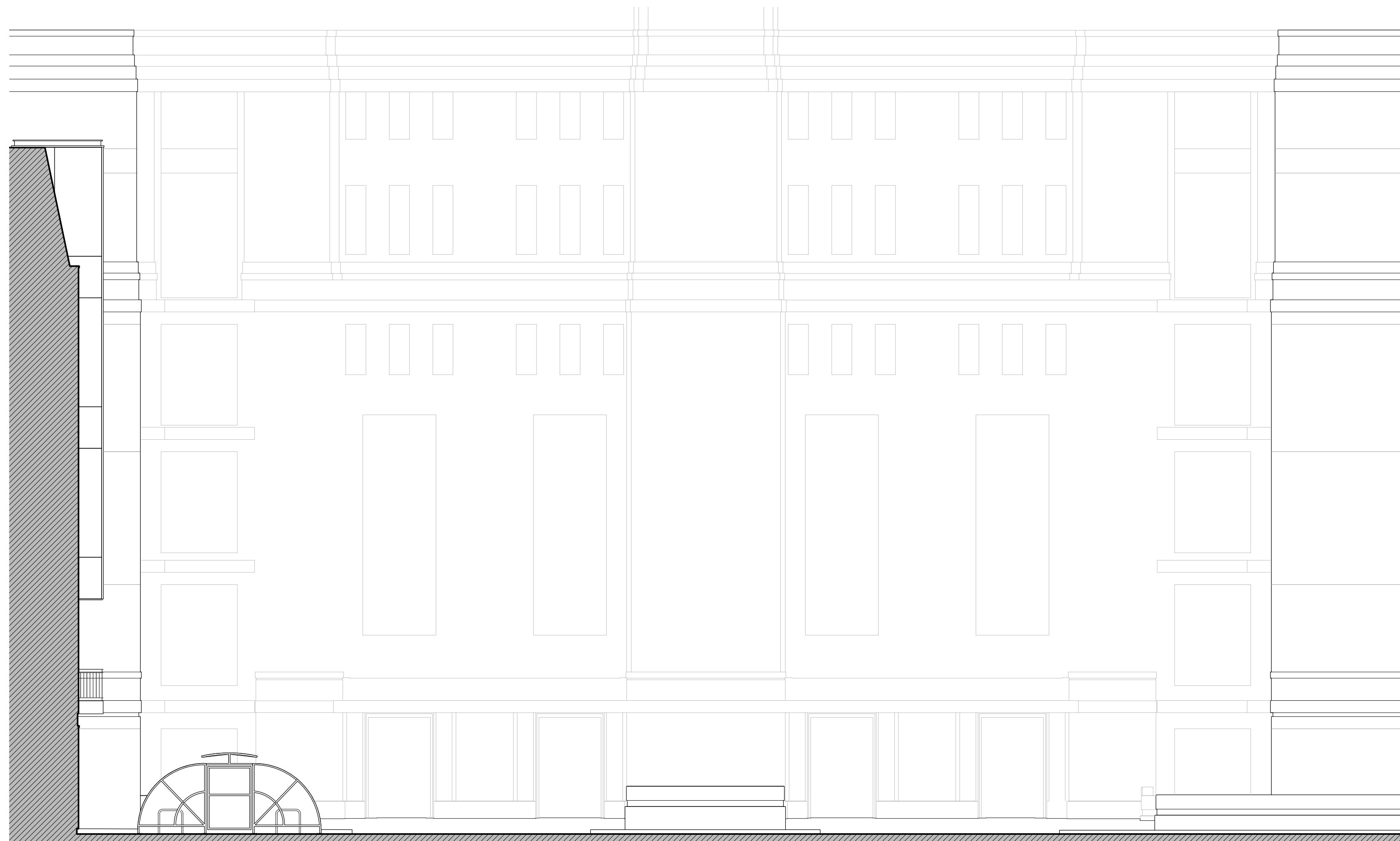
PROPOSED WEST ELEVATION Scale 1:100