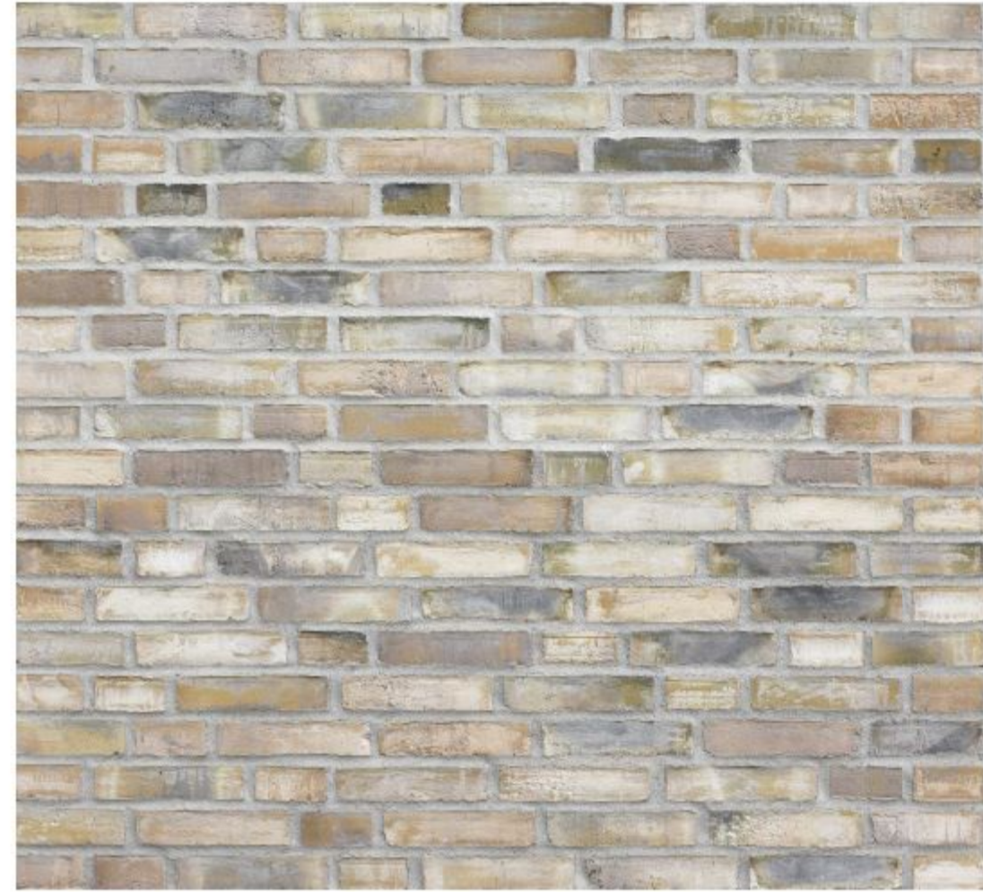
Facing Brick: Peteresen Tegl Waterstruck and coal fire brick, yellow shade.