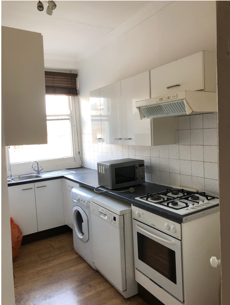
Kitchen as existing