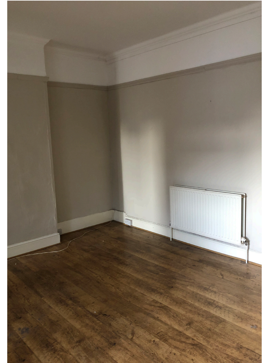
Bedroom as existing