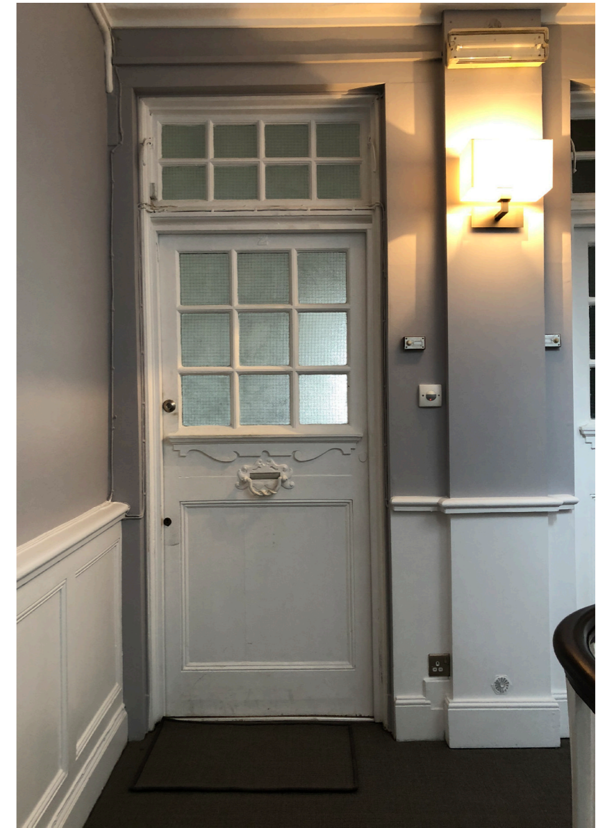
Entrance Flat 2