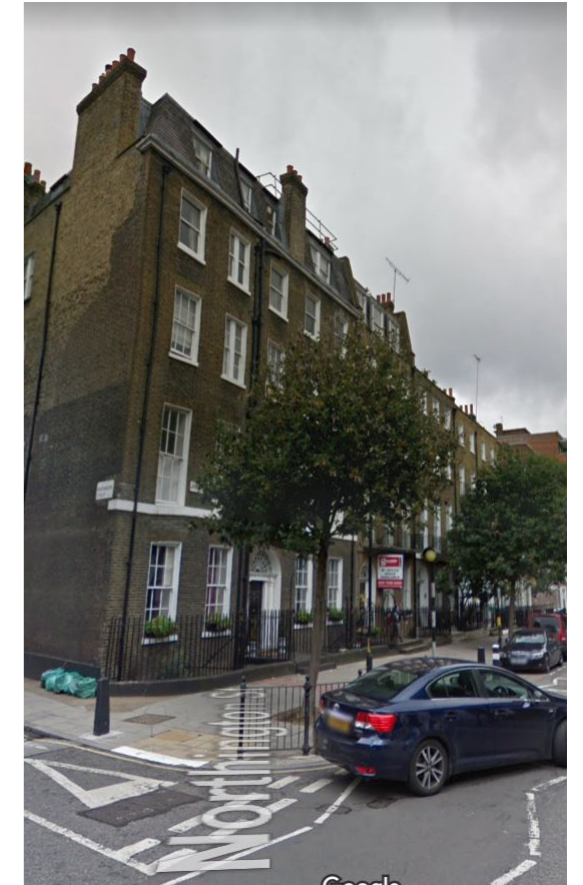
28 John Street

The site is located on John Street on the corner with Northington Street which belongs to Bloomsbury Conservation Area.