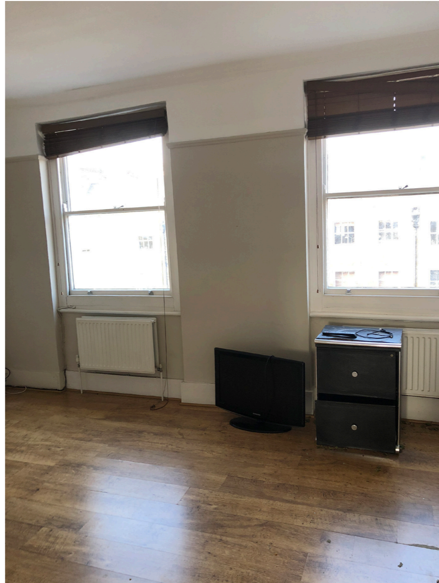
Living Room as existing