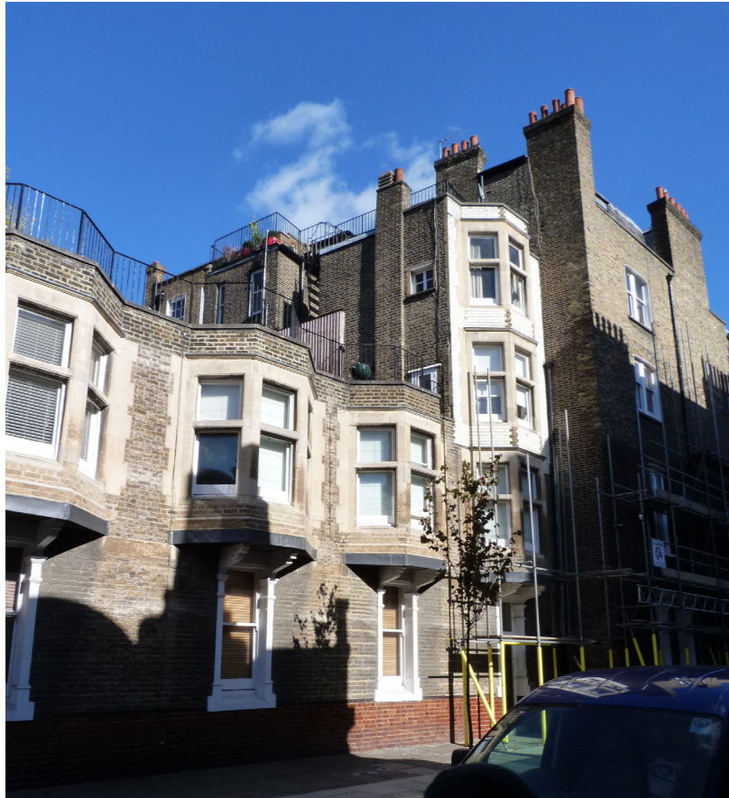
Side and Rear elevation from Northington Street