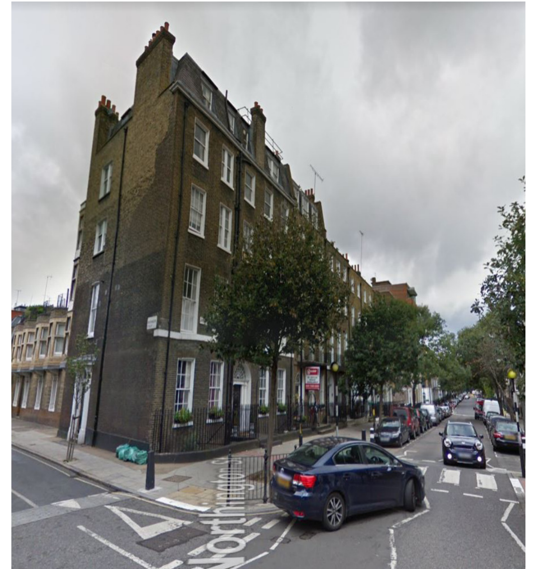
Design and Access Statement Flat 2