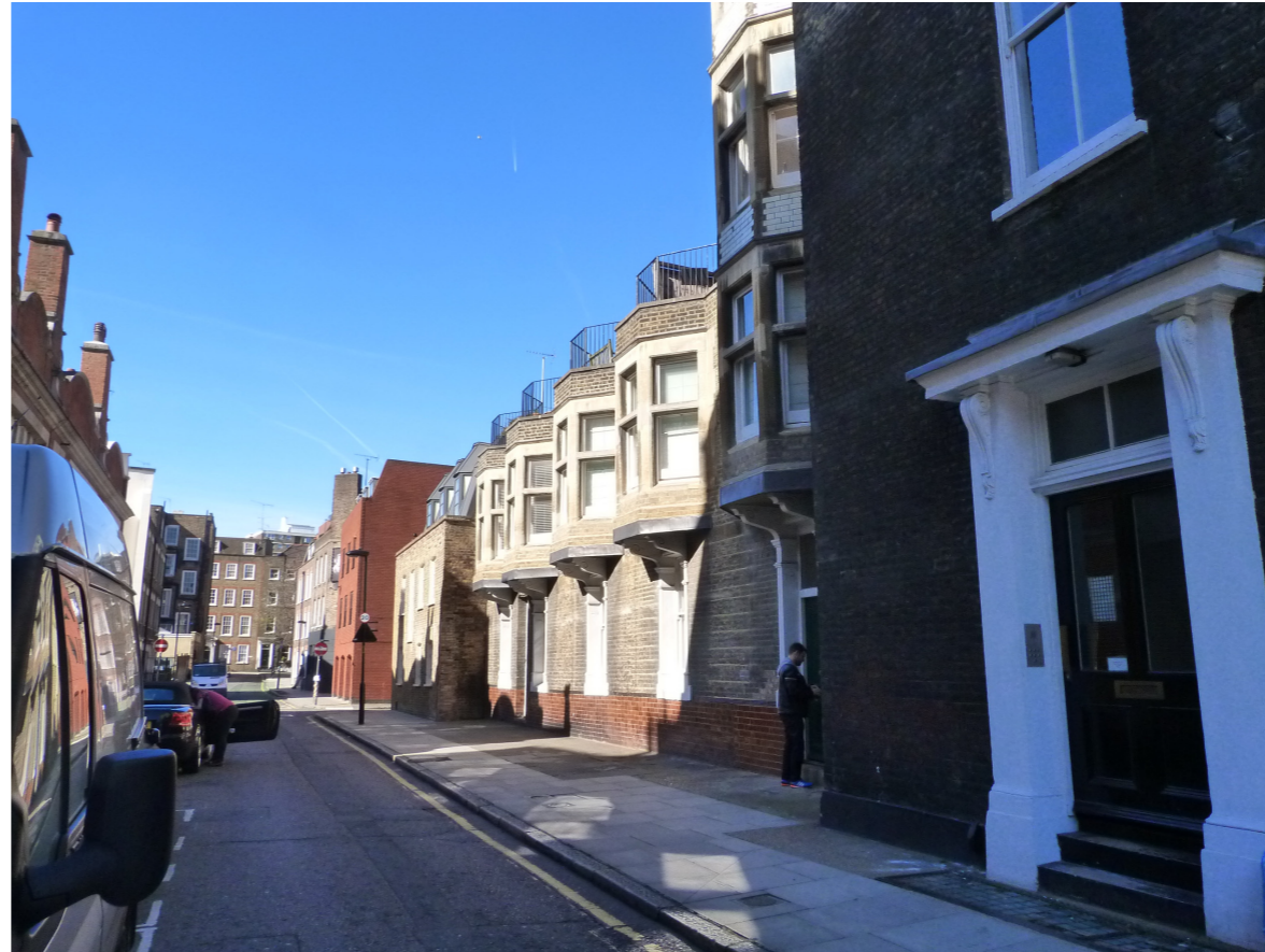
Side Entrance 28 John Street