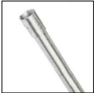
Typical round metal trunking