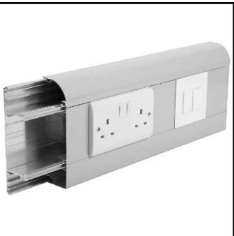
Typical aluminium dado trunking

NOTE: Metal clad faceplates to be used, not plastic as shown