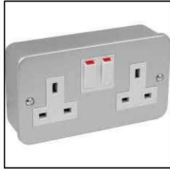
Typical metal clad socket

NOTE: Typically dado trunking will be mounted between 900 and 1100 above FFL on the teaching walls. The finished height will need to be coordinated on site as the heights of the whiteboards do vary.