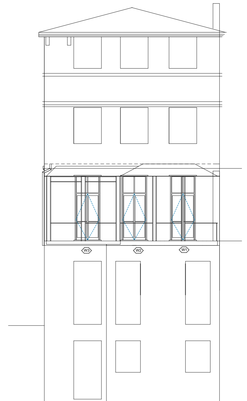
Existing South Elevation