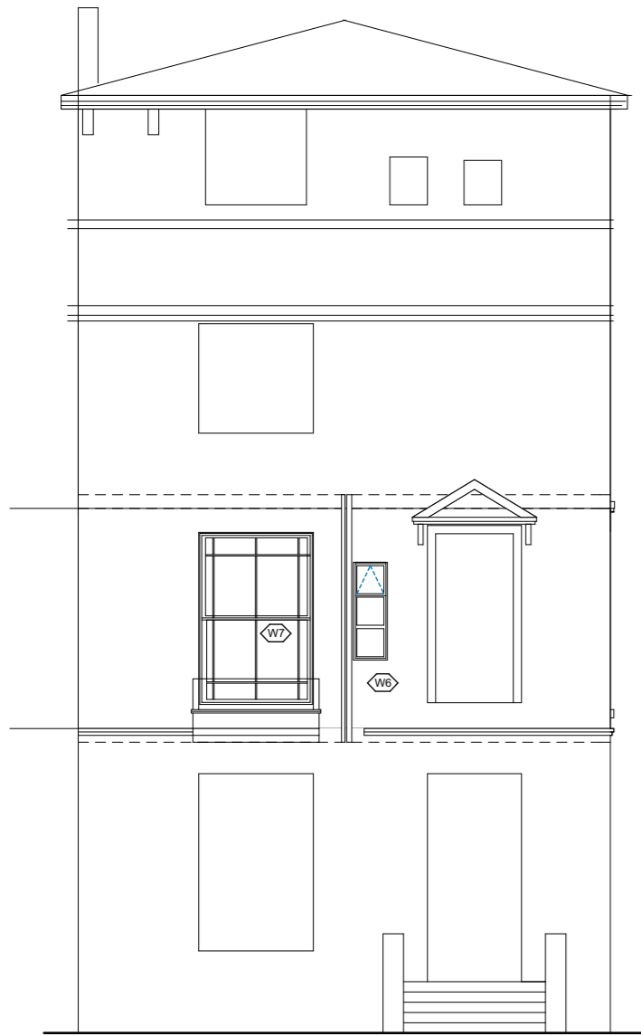
Existing North Elevation.