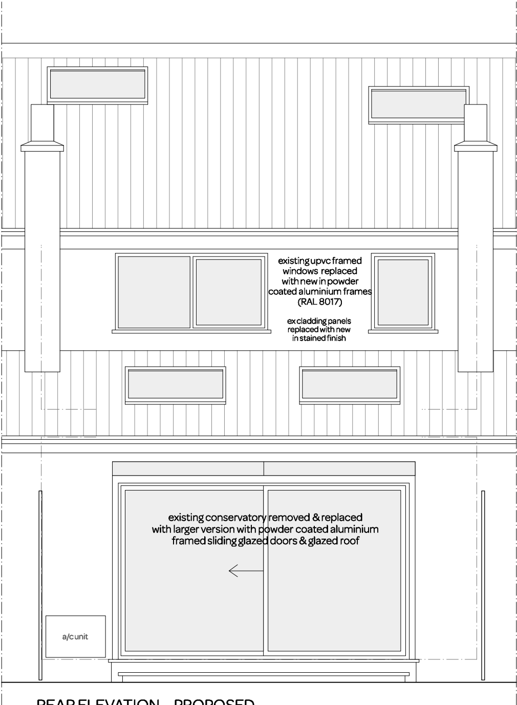
REAR ELEVATION- PROPOSED