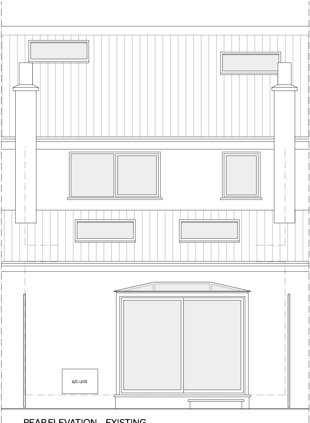
REAR ELEVATION- EXISTING