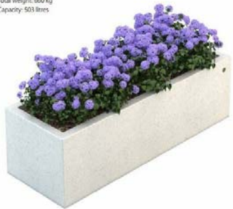
APPROVED ACQUARIO PLANTER TO FRONTAGE