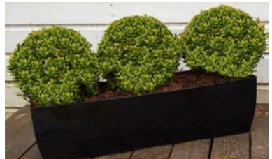
APPROVED BOX BALL CLIPPED PRIVETS