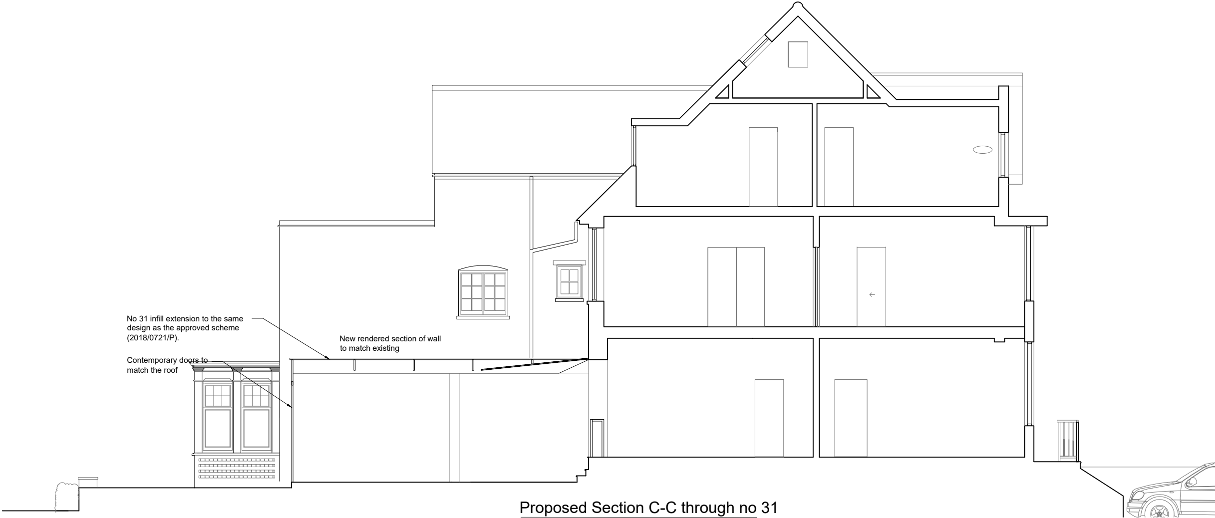
Proposed Section C-C through no 31 Scale 1:50@A1 Scale 1:100@A3

Revisions:- A 12/07/18 - No 31 infill extension to the same design as the approved scheme (2018/0721/P).