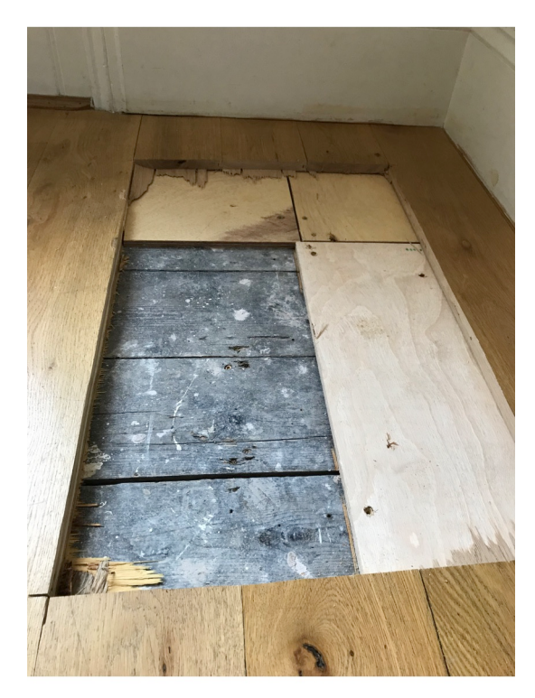
Ground Floor- Existing Floor Materials-18mm non-original floorboards, 12mm plywood, older floorboards