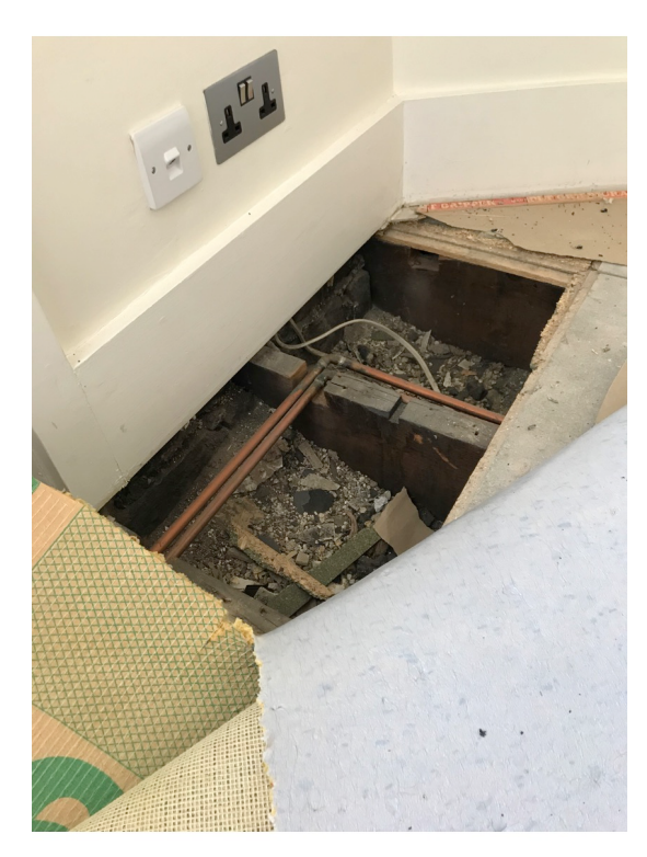
Second Floor- Existing Floor Materials-carpet / 18mm chipboard