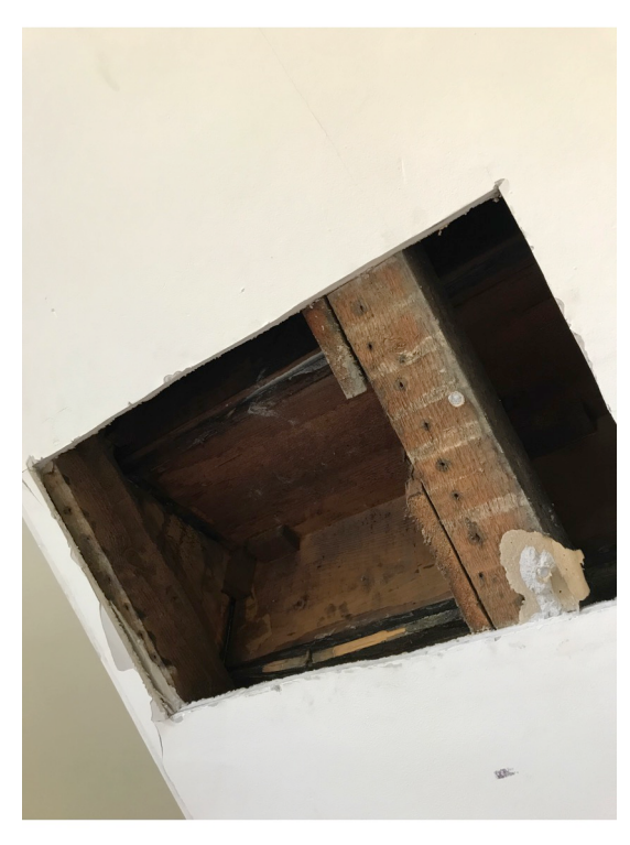
Stairs First floor to Second floor Detail showing Structure