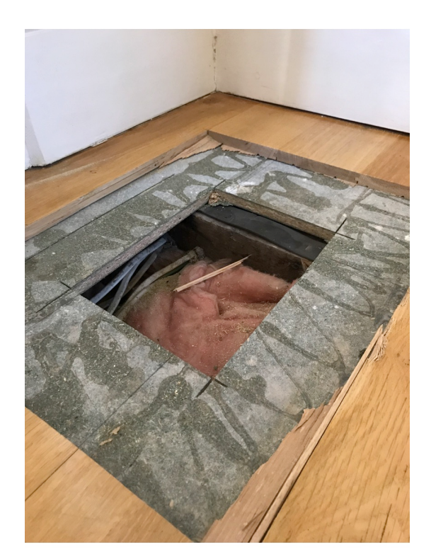
First Floor- Existing Floor Materials-18mm non-original floorboards, 18mm chipboard