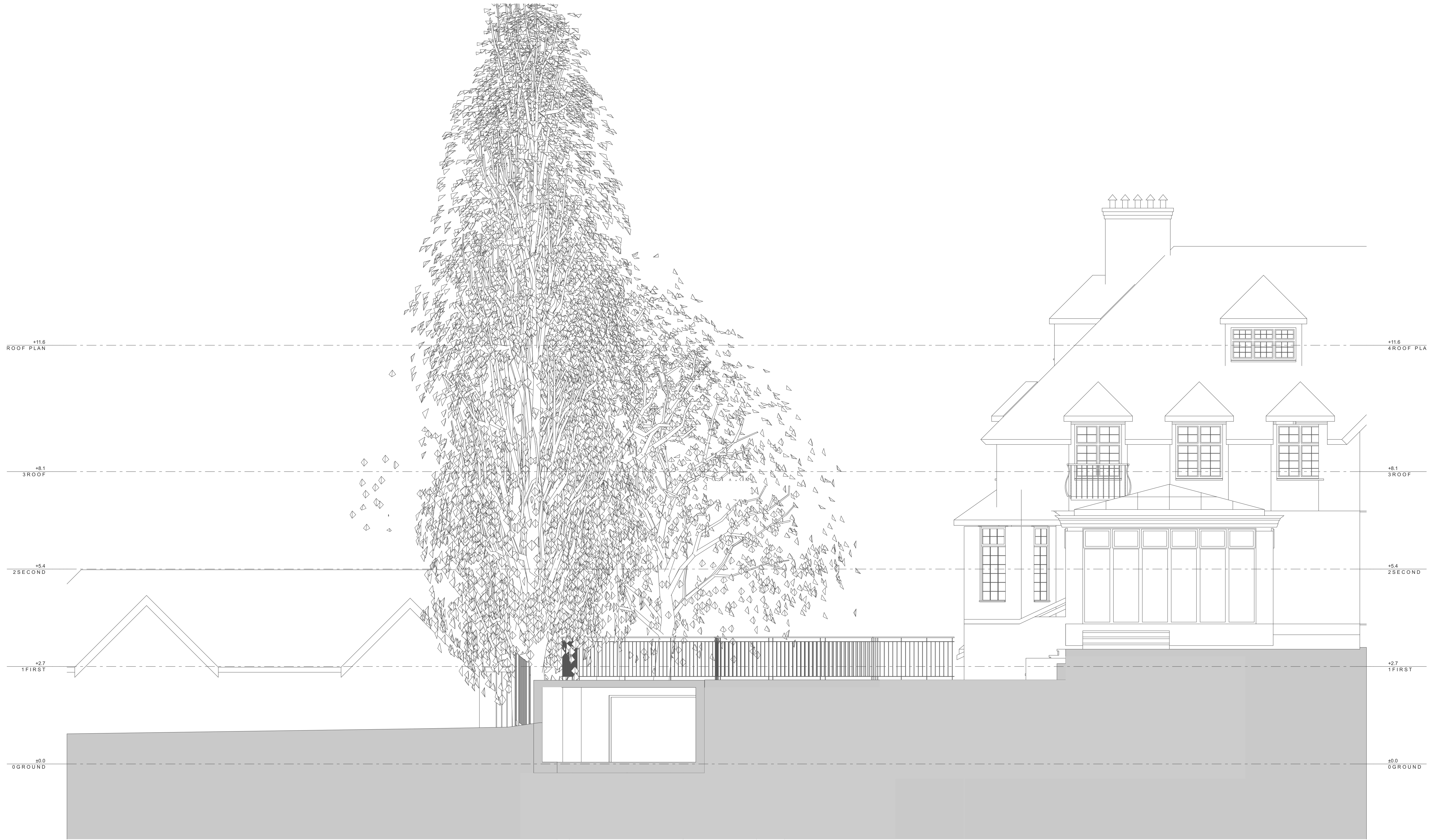
C SHORT SECTION 1:50