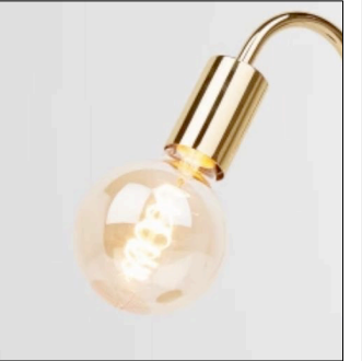
'OCTAVIA' BULB AND FITTING SUPPLIED BY MADE