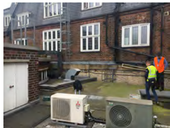
existing photographs scale nts