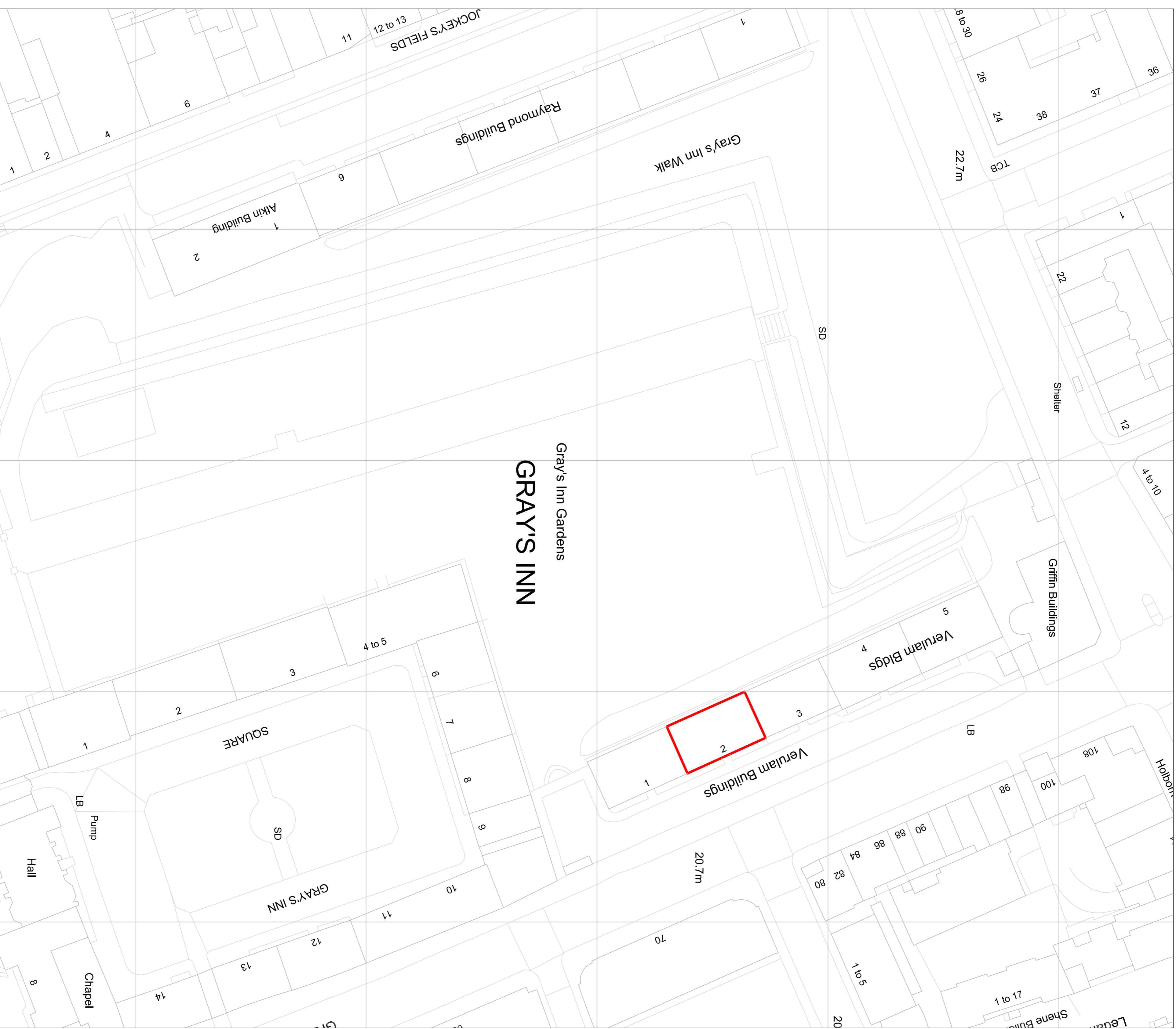
2 Site Plan 1:500