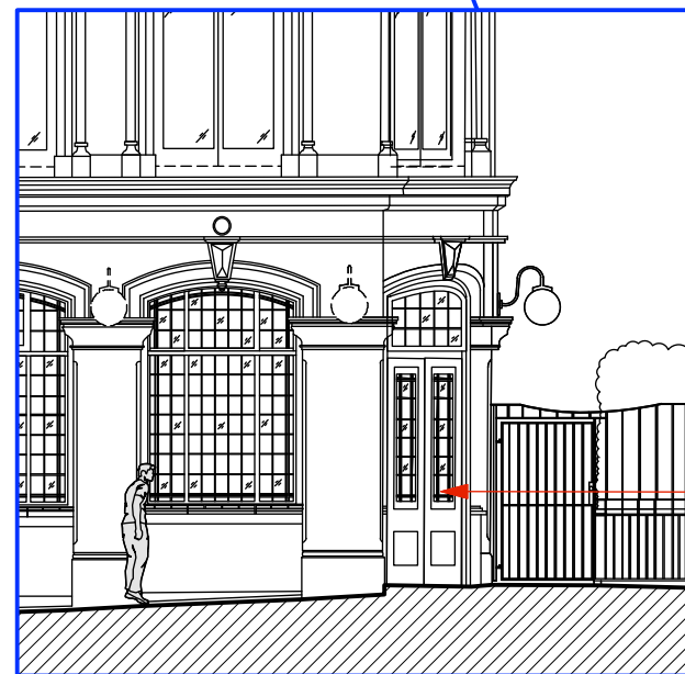
PROPOSED FRONT ELEVATION scale 1 : 100