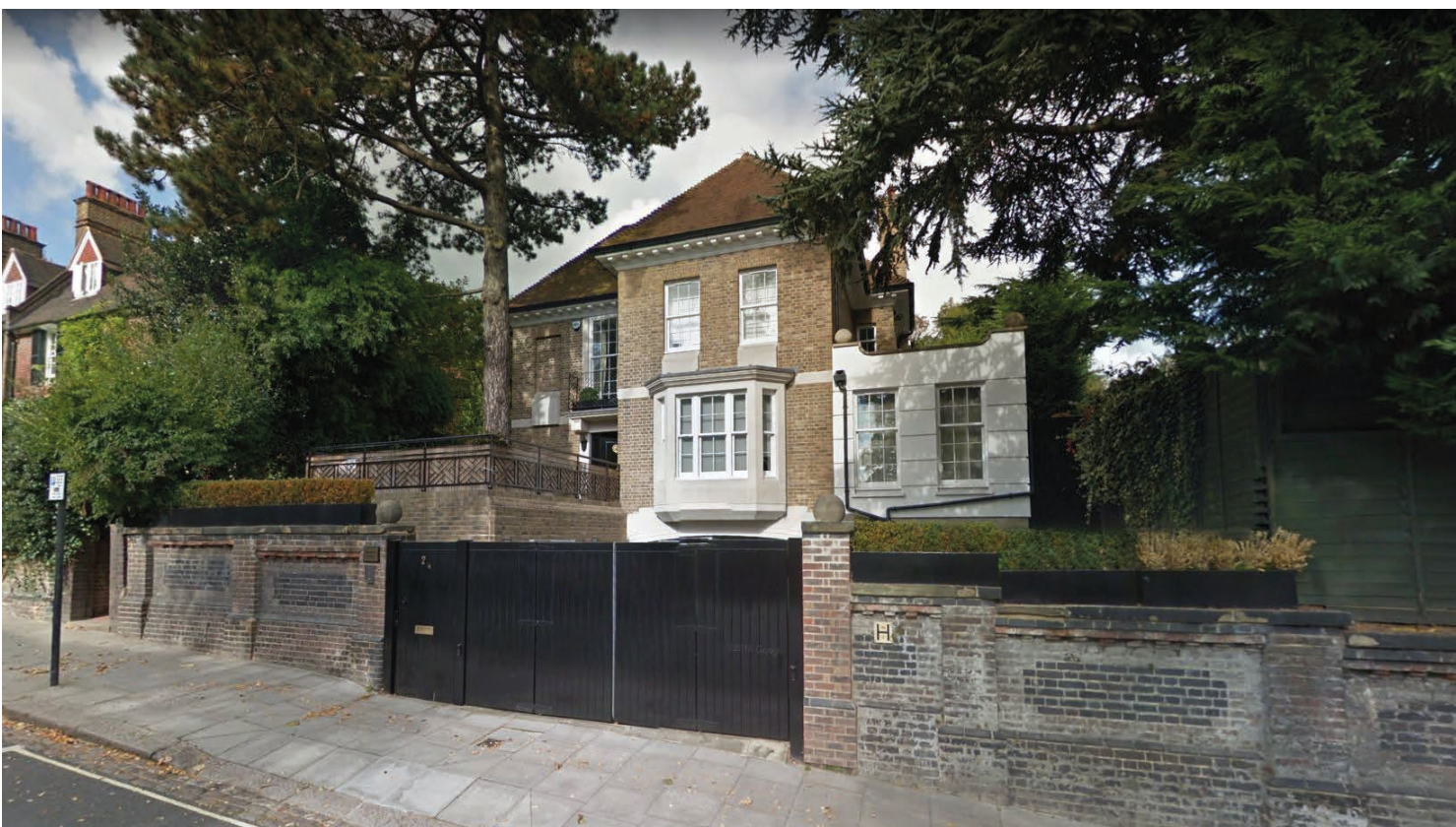
No. 2a Redington Road Boundary height= approx. 1875mm