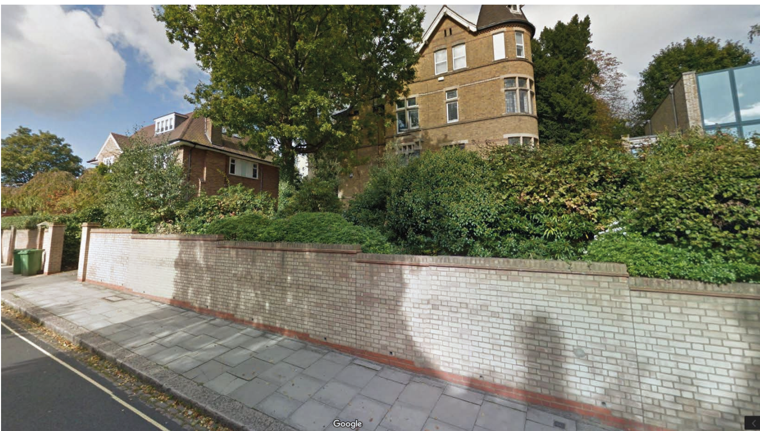
No. 6 Redington Road Boundary height= approx. 1800mm