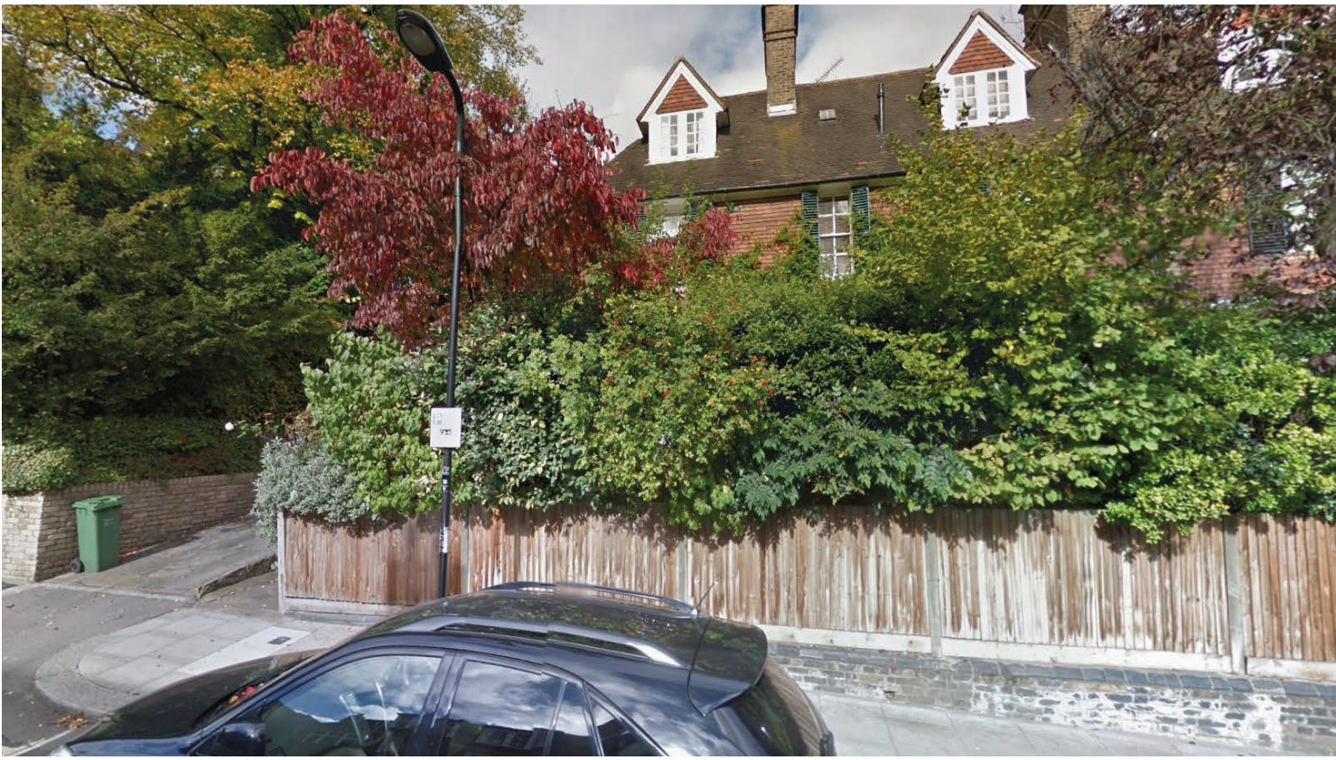
No. 4 Redington Road Boundary height= approx. 1125mm (Brick + timber fence)