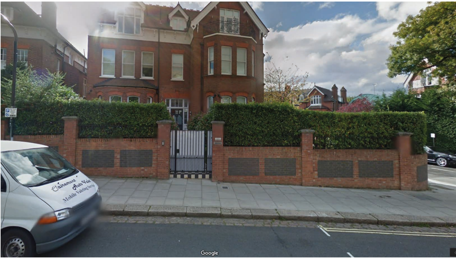
No. 25 Redington Road Boundary height= approx. 1350mm / 2400mm with hedges