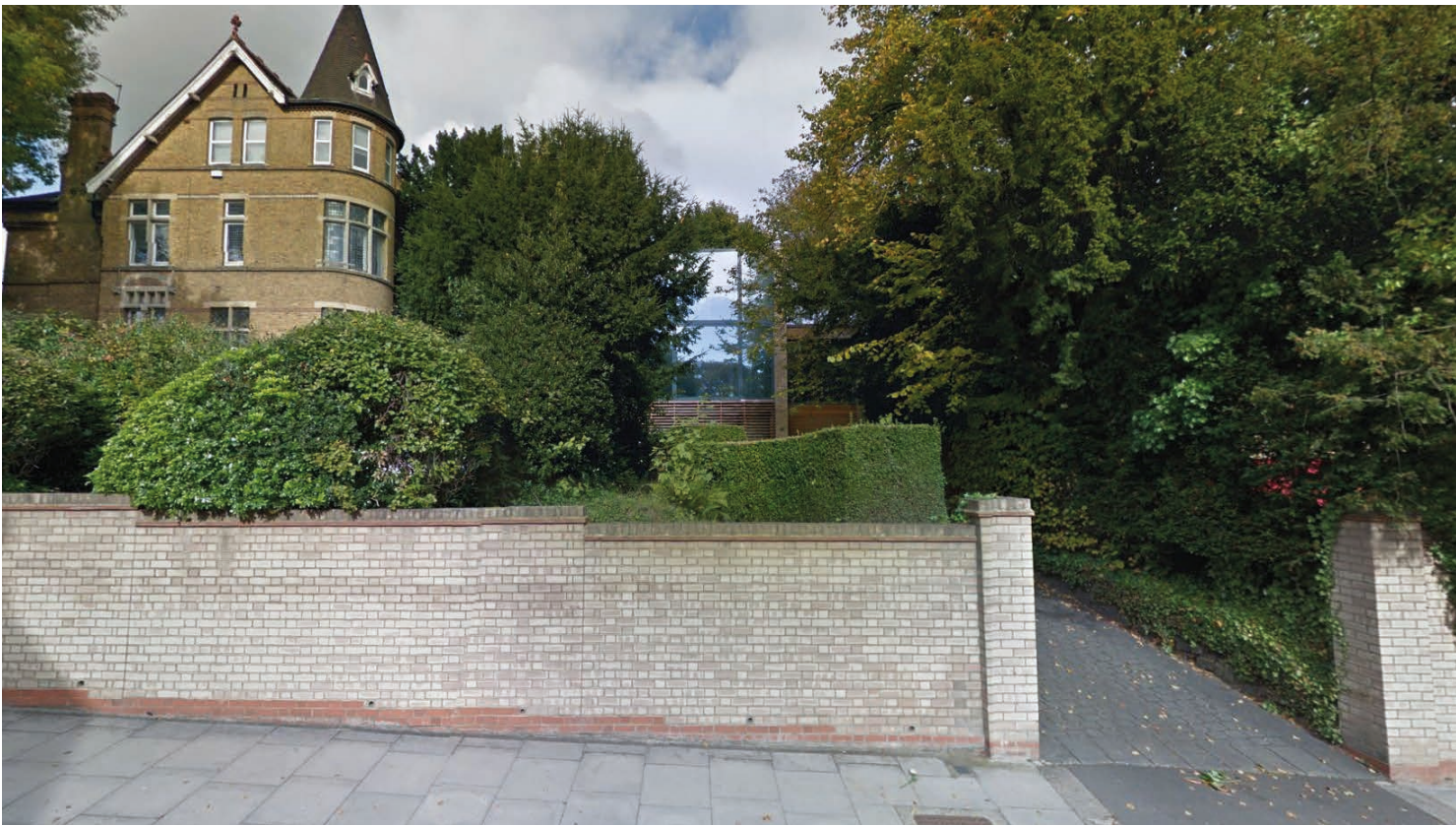
The Cottage - Redington Road Boundary height= approx. 1800mm