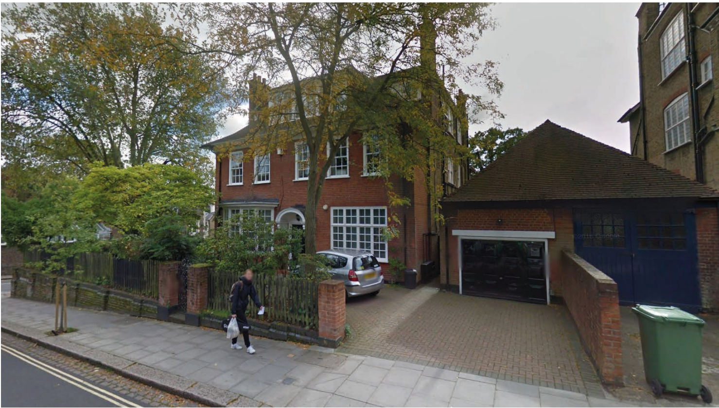
No. 1 Redington Road Boundary height= approx. 1200-1500mm