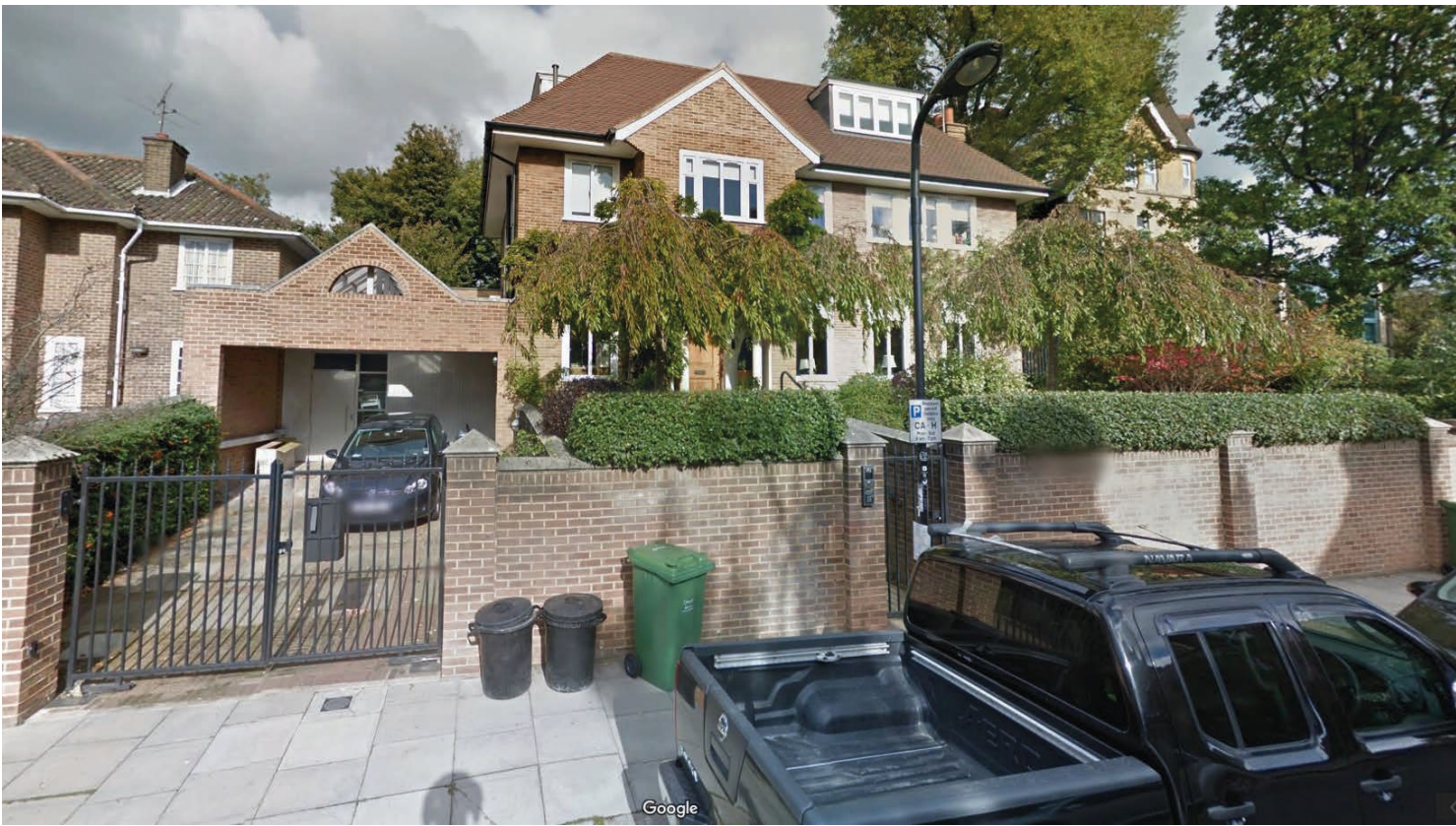
No. 8 Redington Road Boundary height= approx. 1700mm