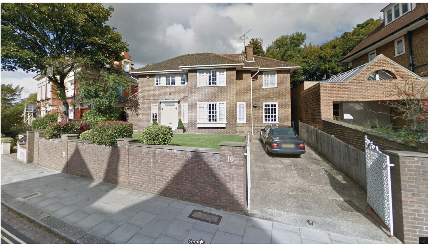
No. 10 Redington Road Boundary height= approx. 1500mm