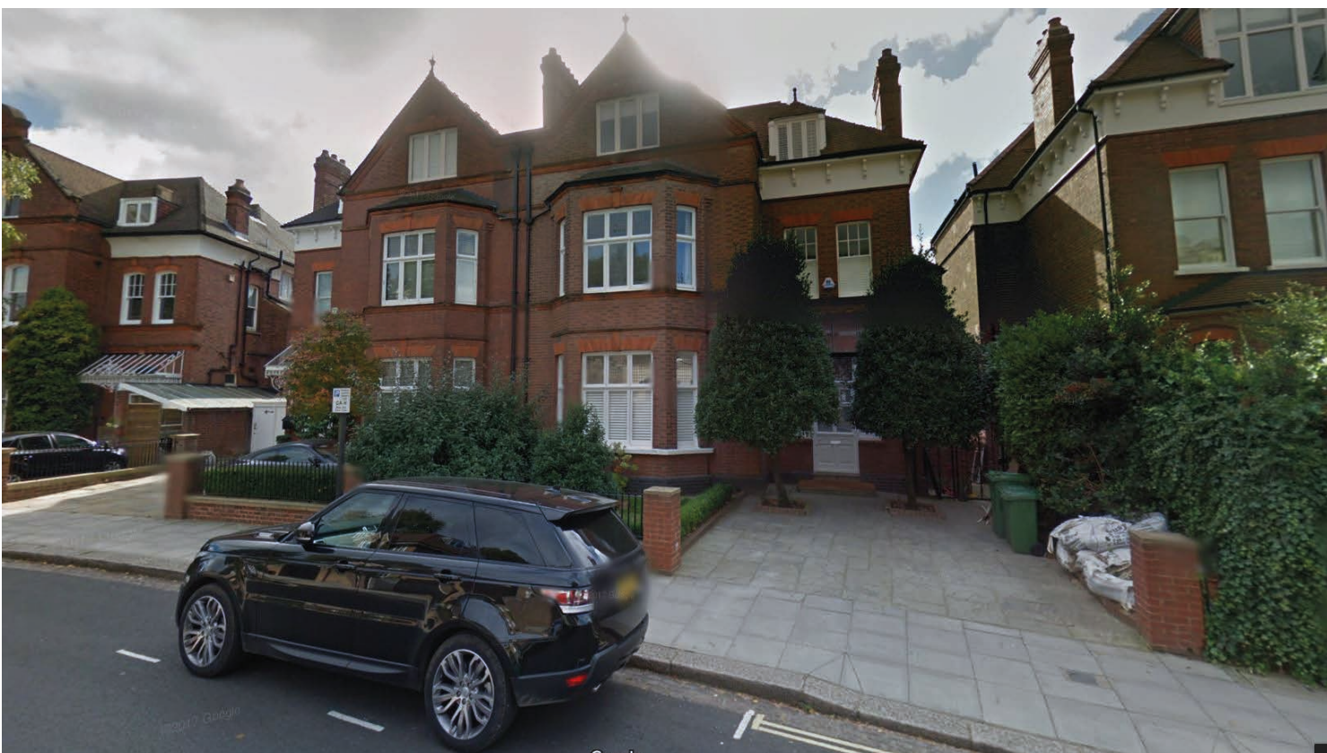
No. 10 Redington Road Boundary height= approx. 1050mm