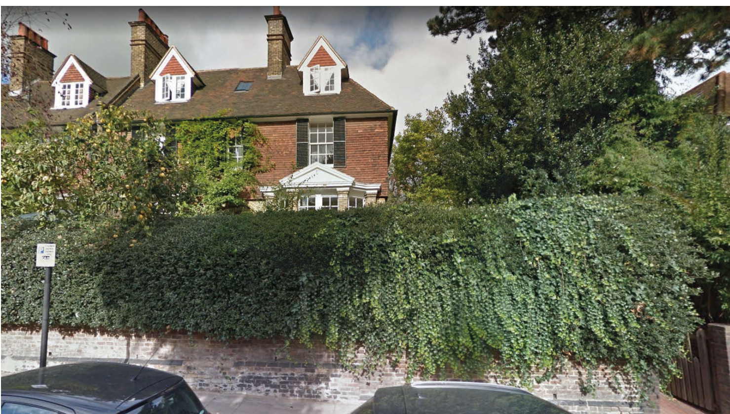
No. 2 Redington Road Boundary height= approx. 1575mm (Brick) / 2500mm with Hedges