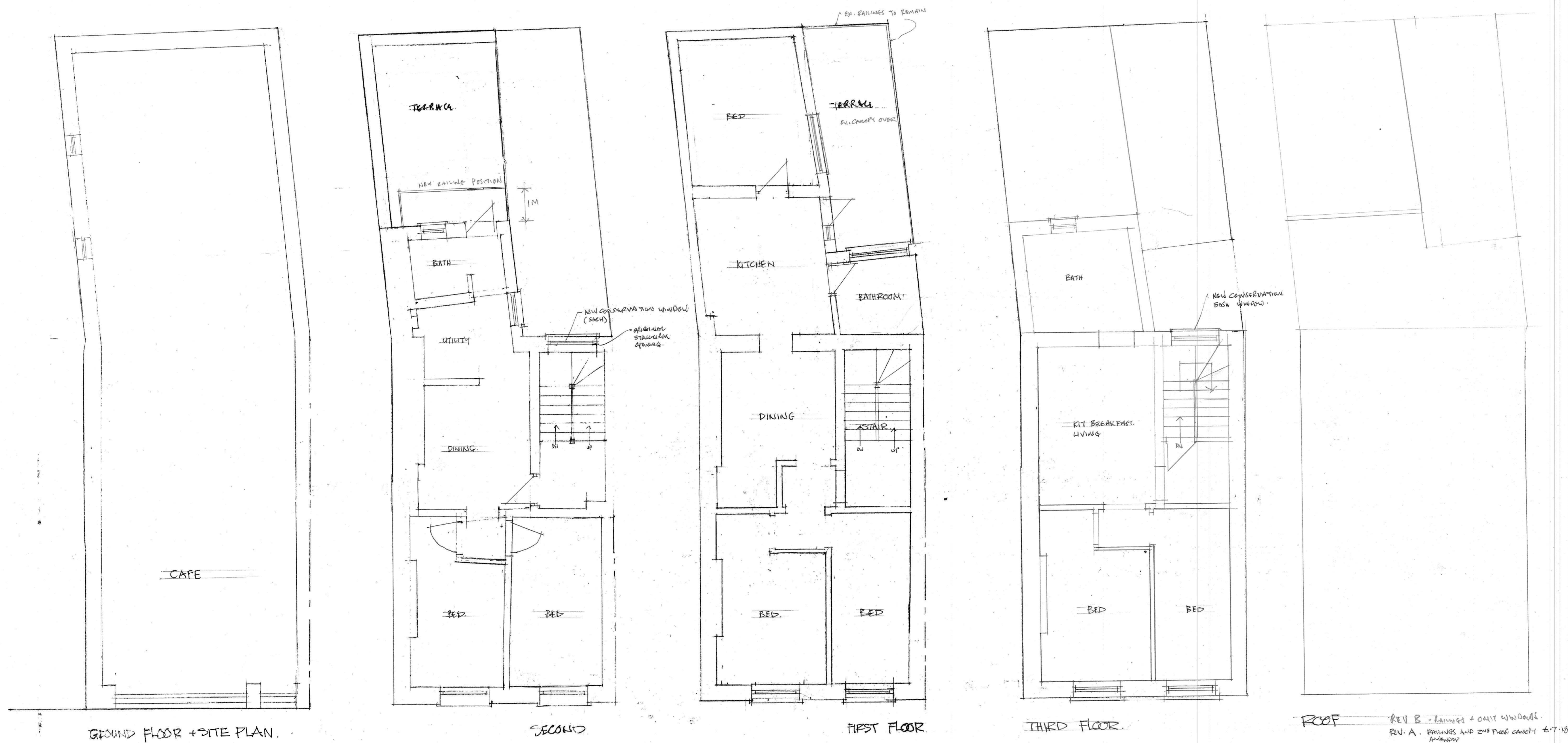
GROUND FLOOR + SITE PLAN.