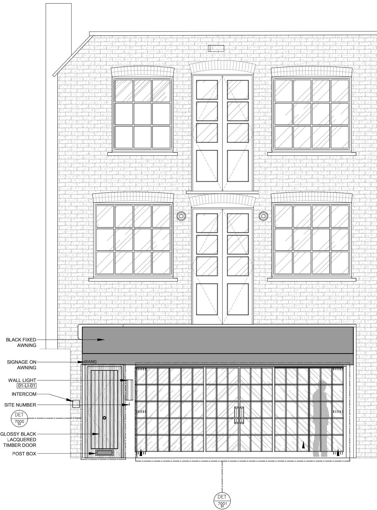
A ELE. A - 1:50 @A3

ALL IDEAS, DESIGNS AND PLANS INDICATED OR REPRESENTED BY THESE DRAWINGS ARE OWNED BY AND ARE THE PROPERTY OF JOYCE WANG LTD. AND WERE CREATED AND DEVELOPED FOR USE IN CONNECTION WITH THE SPECIFIED PROJECT. NONE OF SUCH IDEAS, DESIGNS OR PLANS SHALL BE USED FOR ANY PURPOSE WHATSOEVER WITHOUT WRITTEN PERMISSION OF JOYCE WANG LTD. DO NOT SCALE FROM DRAWINGS. CONTRACTORS HAVE THE RESPONSIBILITY TO DEVELOP ALL DETAILS FURTHER WHEN REQUIRED. DO NOT SCALE FROM THIS DRAWING.