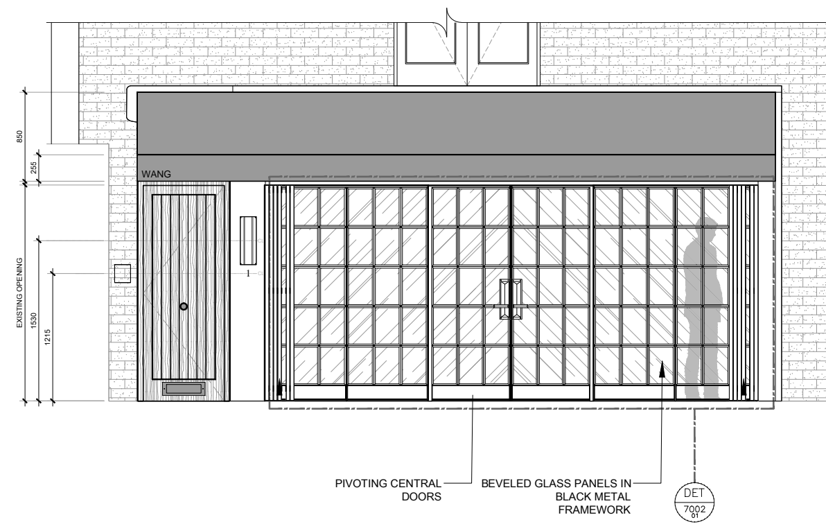
B ELE. B - FACADE OPEN 1:50 @A3